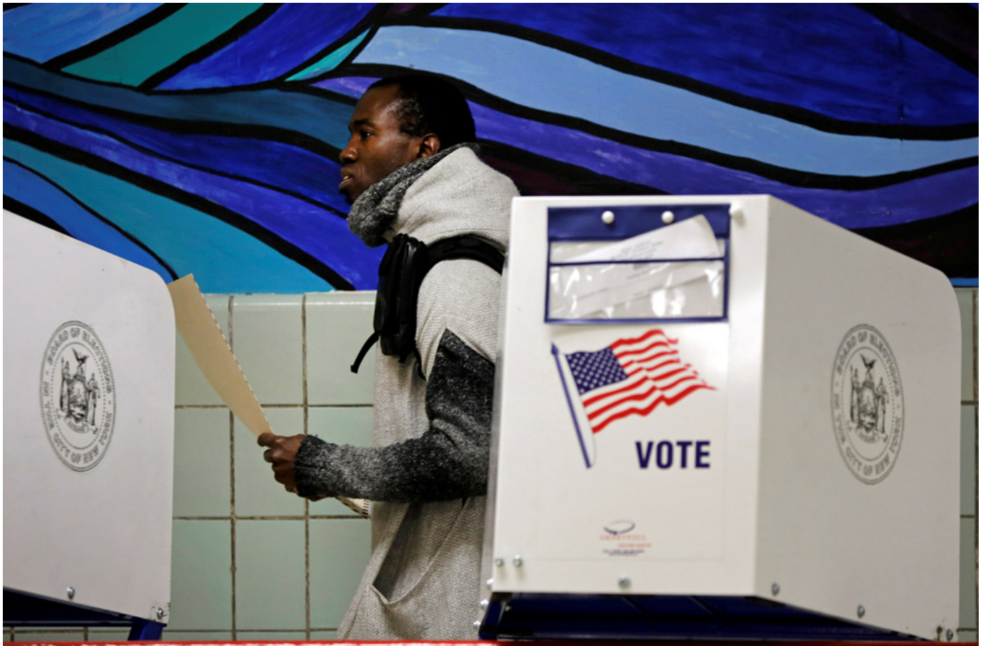
A voter carries his ballot behind a voting booth at a polling station in the Bronx section of New York City during the 2016 U.S. presidential election.

Another study shows that people do not rate their political identity as very important to their overall identity. People are much more likely to say that their family status (e.g., husband, mother), religion, gender, age, occupation, nationality, race and region of the country are more important than their politics; in fact, the only thing political identity outranks is social class. However, the authors note that although political identity itself is not highly ranked, these more important identities — like gender, religion and family status — tend to correlate with a political identity. It is a matter of "identity politics." So while a male, Christian Southerner and a black, urban mother both may not rank their political identity as high, their other aspects that they do rank high are wrapped up in their politics. However you roll the dice, politics matters.