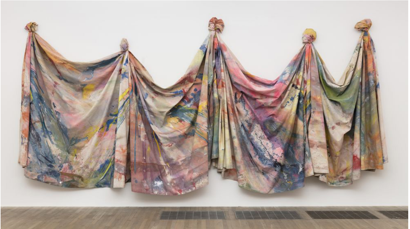
Sam Gilliam, "Carousel Change," by Sam Gilliam, 1970, from Tate Museum, courtesy of the artist and David Kordansky Gallery, Los Angeles, California; © Sam Gilliam

Bowling's expansive abstract landscapes in acrylic that faintly reveal stencils of continents formerly laid beneath them. And William T. Williams' homage to John Coltrane, "Trane" (1969), a terrific, slashing spectrum of diagonal bands of color intersecting and overlaying each other and loosely organized around an irregular rectangle angled at 45 degrees in the center of the painting.