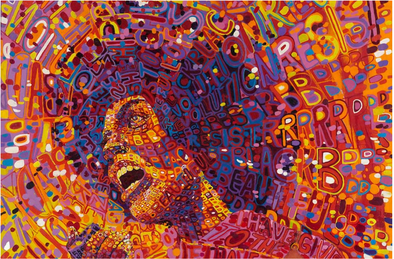
"Revolutionary (Angela Davis)" by Wadsworth Jarrell, 1971. © Wadsworth A. Jarrell. (Courtesy of Brooklyn Museum)