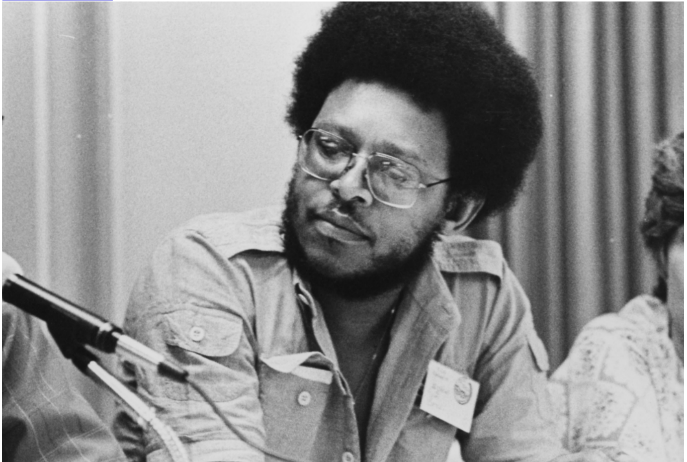
James Cone at a theology conference in Detroit in August 1980