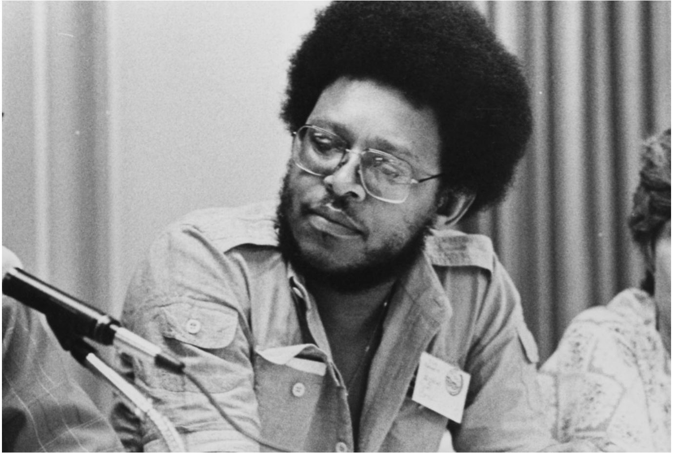
James Cone at a theology conference in Detroit in August 1980