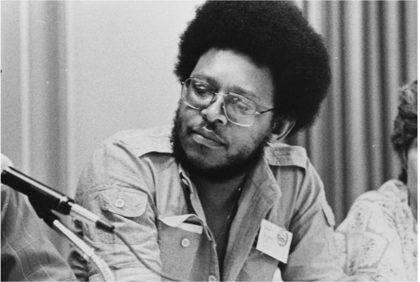
James Cone at a theology conference in Detroit in August 1980