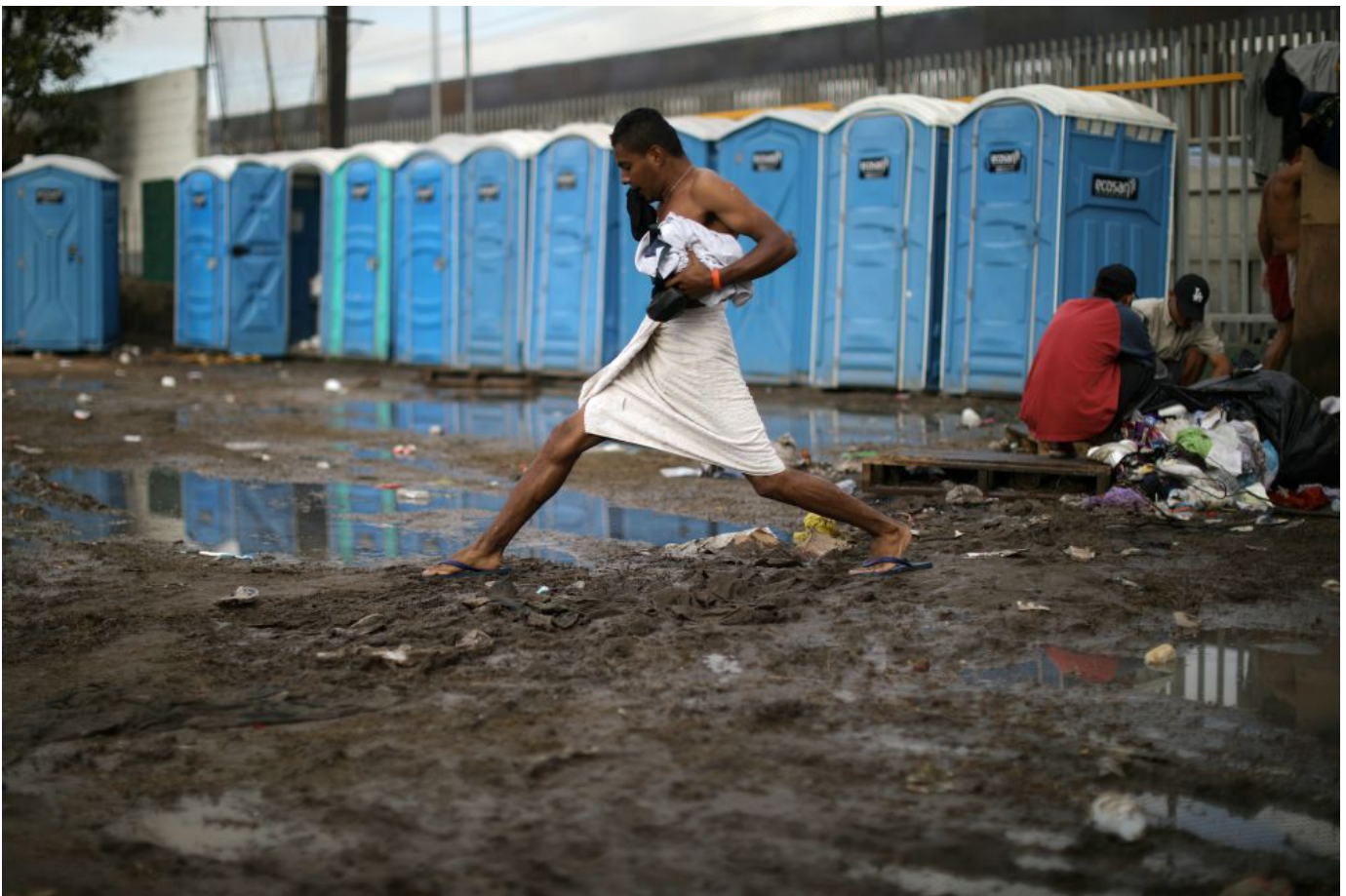
A migrant who is part of a caravan of thousands from Central America trying to reach the United States steps across mud after taking a shower Nov. 28 at a temporary camp in Tijuana, Mexico.

President Donald Trump has made it clear that he doesn't want caravan members to enter the U.S. in any way and has demanded that countries they pass through halt the group. Although this didn't stop thousands of migrants from reaching the U.S. border, many did turn back or decide to apply for asylum in Mexico instead of continuing to the U.S.