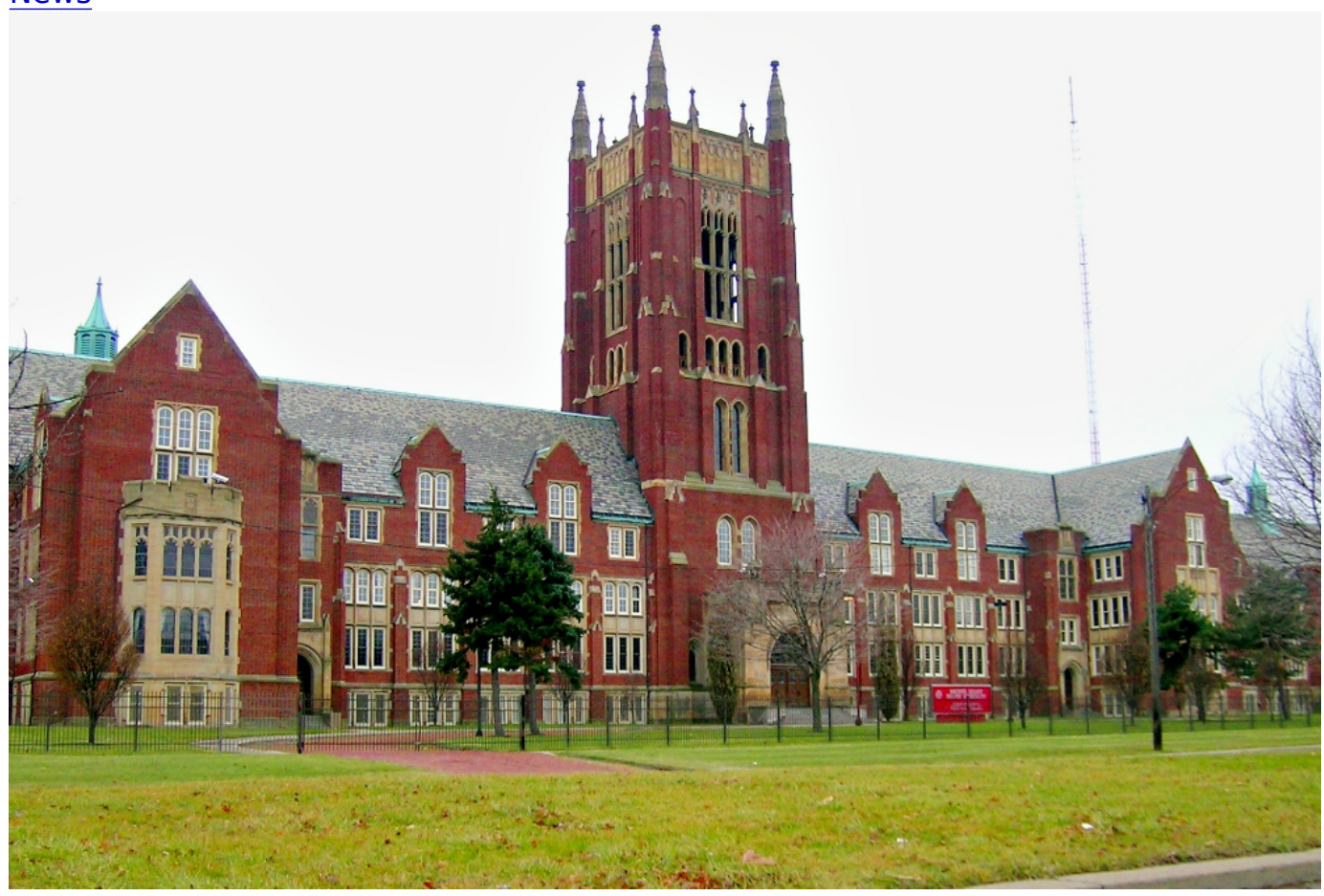
Sacred Heart Major Seminary in Detroit