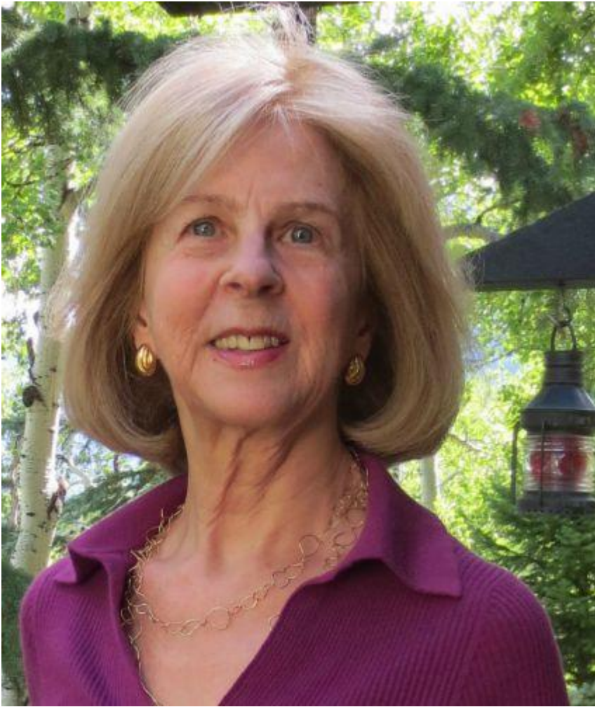
Elaine Pagels