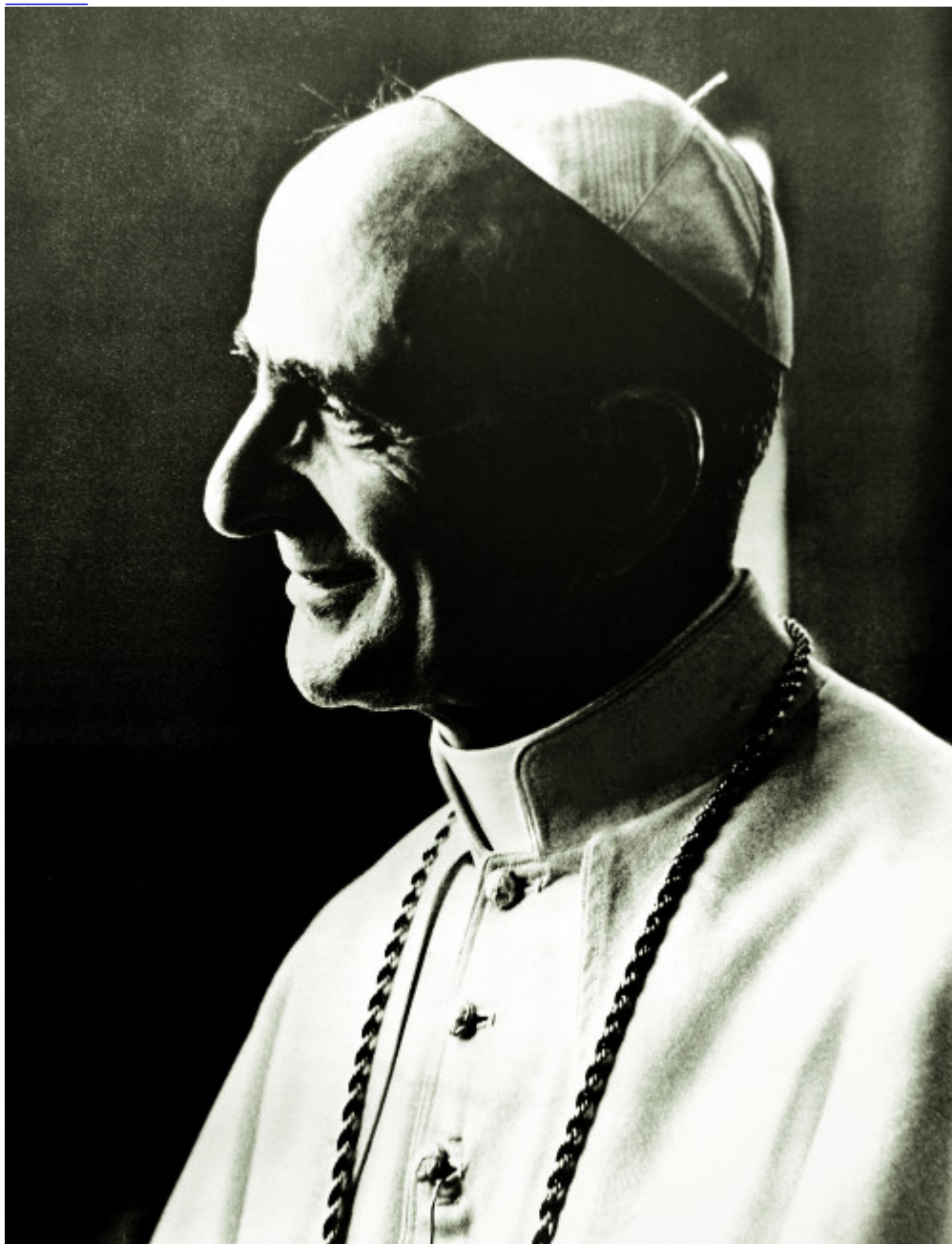
Pope Paul VI is pictured in this undated photo.