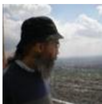
by Gabe Huck