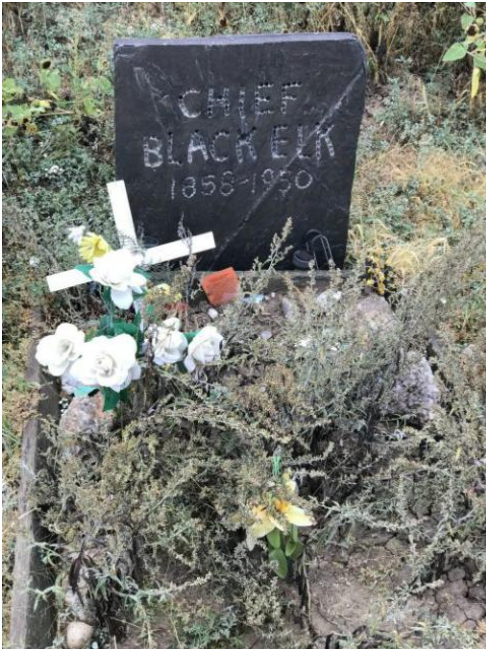
Nicholas Black Elk's grave in St. Agnes Catholic Cemetery in Porcupine, South Dakota, on the Pine Ridge Reservation (Tim Uhl)

On the main campus, there are three schools (elementary, middle and high school), with a large number of Jesuits and volunteer teachers through Creighton University's Magis Catholic Teacher Corps, a postgraduate service teaching program. Most of the teachers are encouraged to obtain a commercial driver's license so they can drive one of the eight bus routes. All told, the teacher-drivers cover 1,000 collective miles daily to enroll their 600 students.