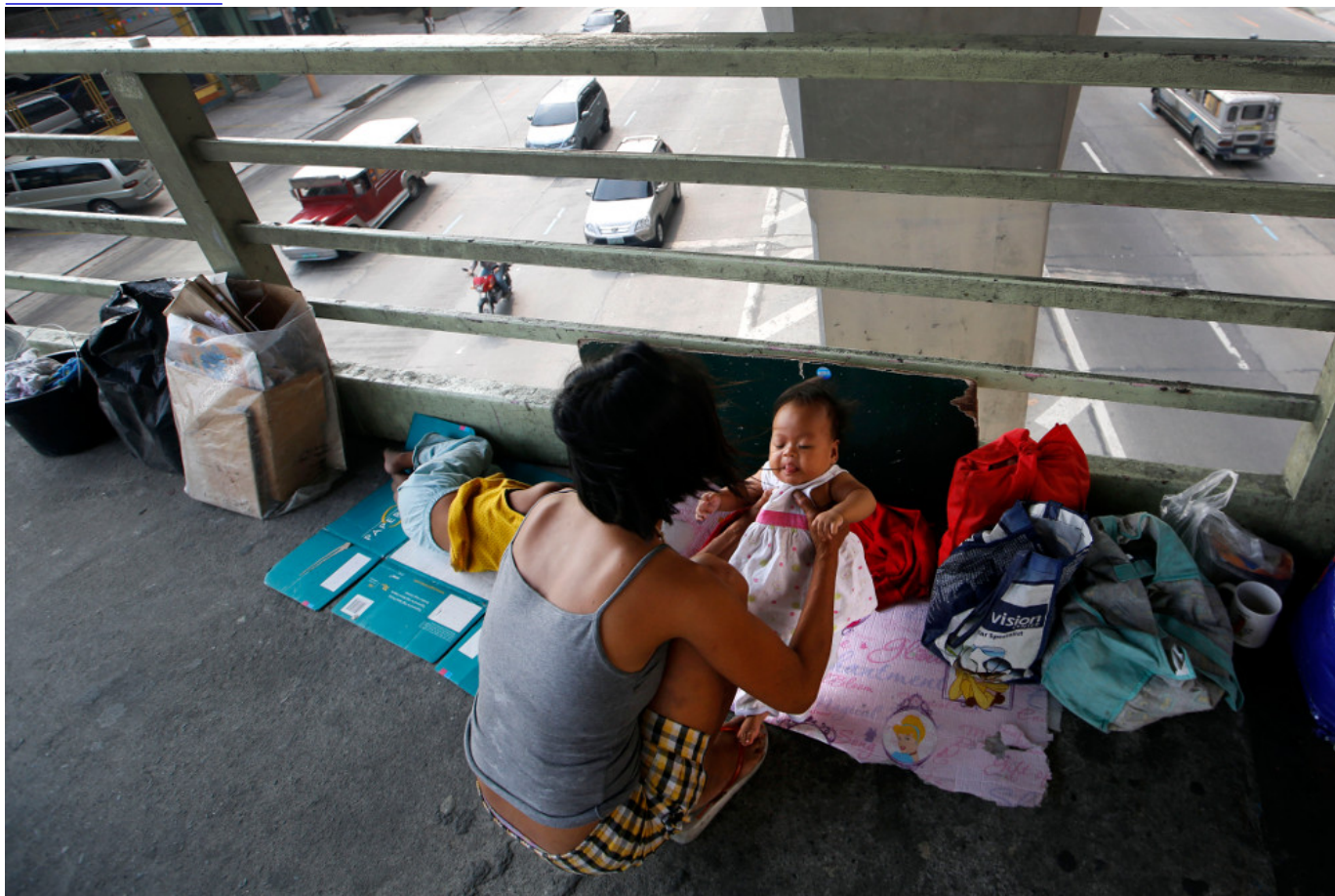
A mother with her children on a footbridge in Manila, Philippines, in 2014