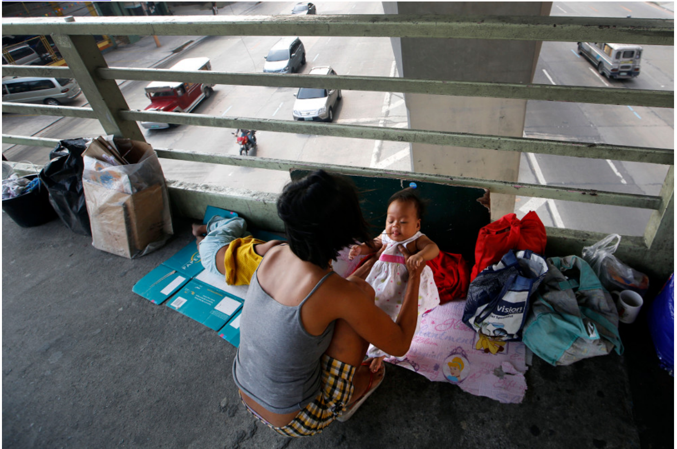
A mother with her children on a footbridge in Manila, Philippines, in 2014