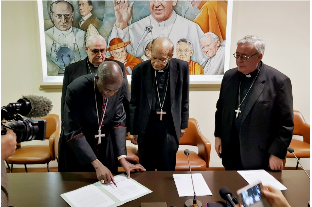
Cardinals and archbishops sign a joint statement at the Vatican Oct. 26, 2018, calling on the international community to take action against climate change.