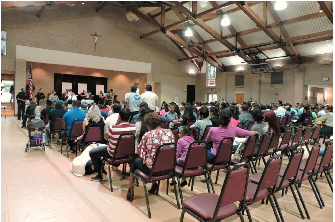
Local city and county law enforcement officers speak with the community during the FaithAction ID card orientation sponsored by St. Mary Help of Christians Catholic parish in Aiken, South Carolina, fall 2017.