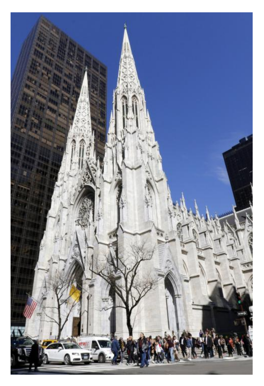
St. Patrick's Cathedral is seen on a sunny afternoon in New York City April 16, 2019. Police say they arrested a man accused of entering St. Patrick's Cathedral with cans of gas and lighters April 17.

Updated 8:15 a.m Central time April 22, 2019.