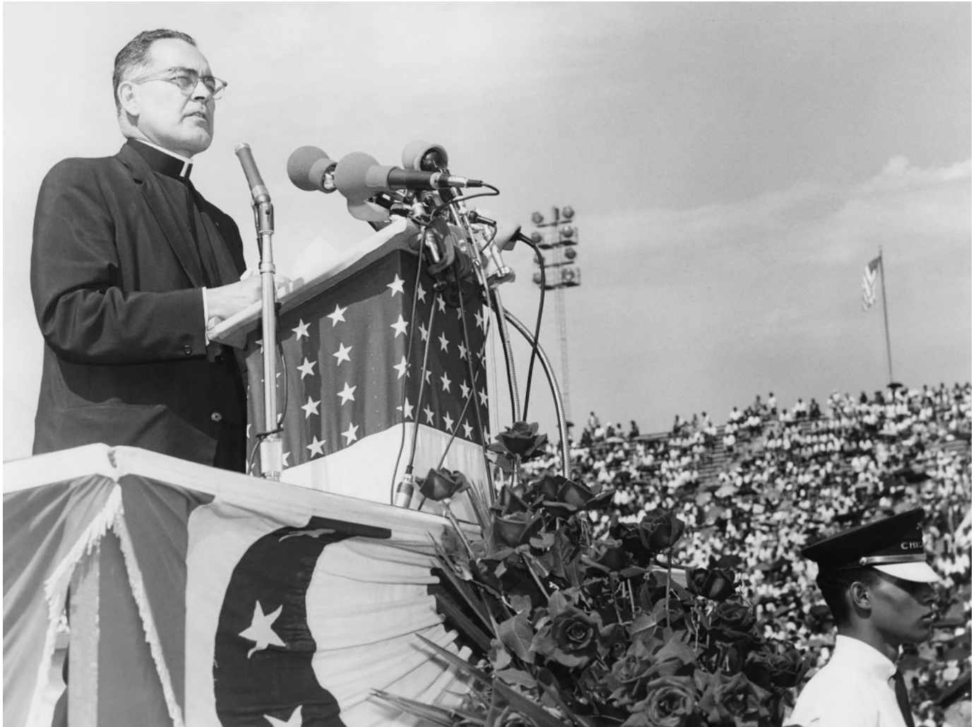
Holy Cross Fr. Theodore Hesburgh speaks at the Illinois Rally for Civil Rights in Chicago in 1964.