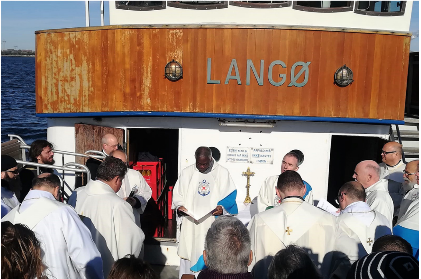
Cardinal Peter Turkson, prefect of the Dicastery for Promoting Integral Human Development, celebrates Mass onboard a ship in Copenhagen May 5 during a Vatican-sponsored conference titled "The Common Good on Our Common Seas."