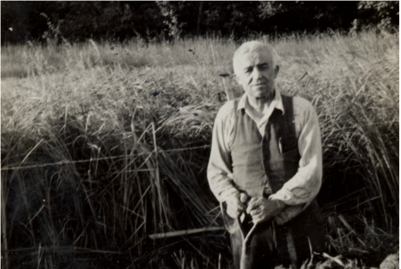
Catholic Worker co-founder Peter Maurin at St. Isidore's Farm in Aitkin, Minnesota, in 1941