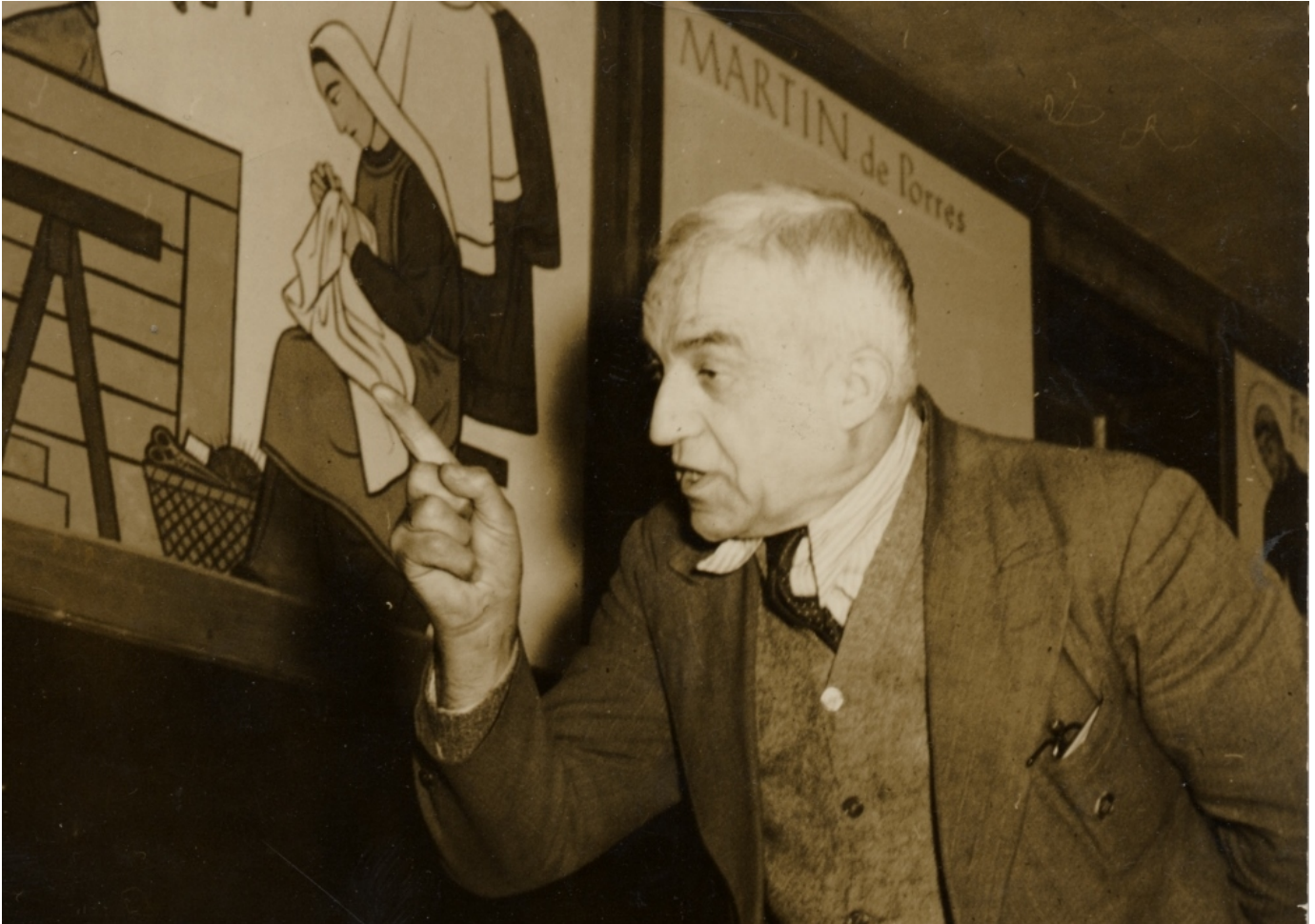
Peter Maurin in the 1930s

While he outlined a three-point program of action — roundtable discussions for "the clarification of thought," houses of hospitality where the works of mercy could be practiced, and founding farming communes or "agronomic universities" — Maurin needed help to implement his vision. In 1932, he sought out Day, a journalist and Catholic convert living in New York City.