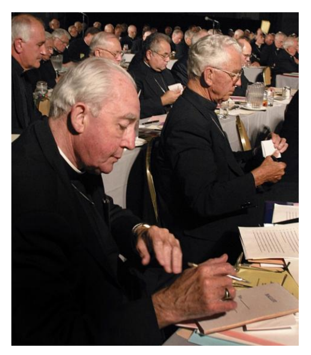
U.S. bishops cast their votes on the Charter for the Protection of Children and Young People at their meeting in Dallas in June 2002.

The sex abuse crisis abides because the complex hierarchical culture refuses to die and refuses to investigate itself in order to identify the flagrantly immoral elements within it.