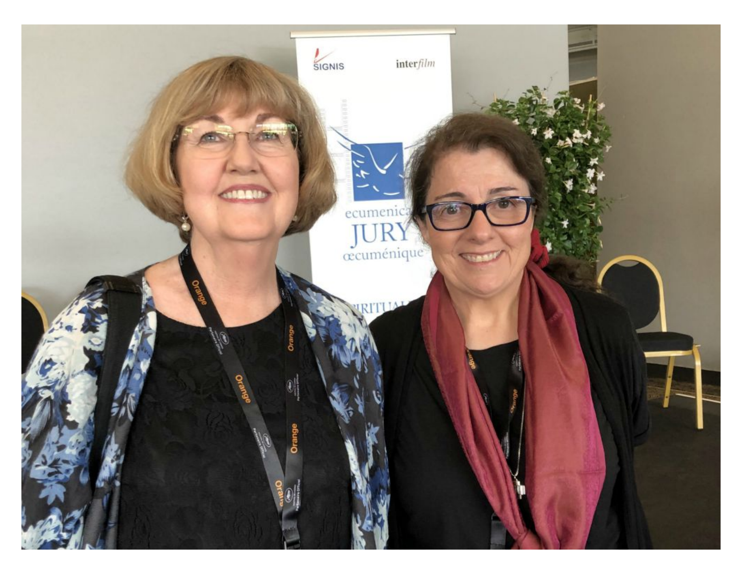
My sister-in-law, left, traveled with me to France for the festival.