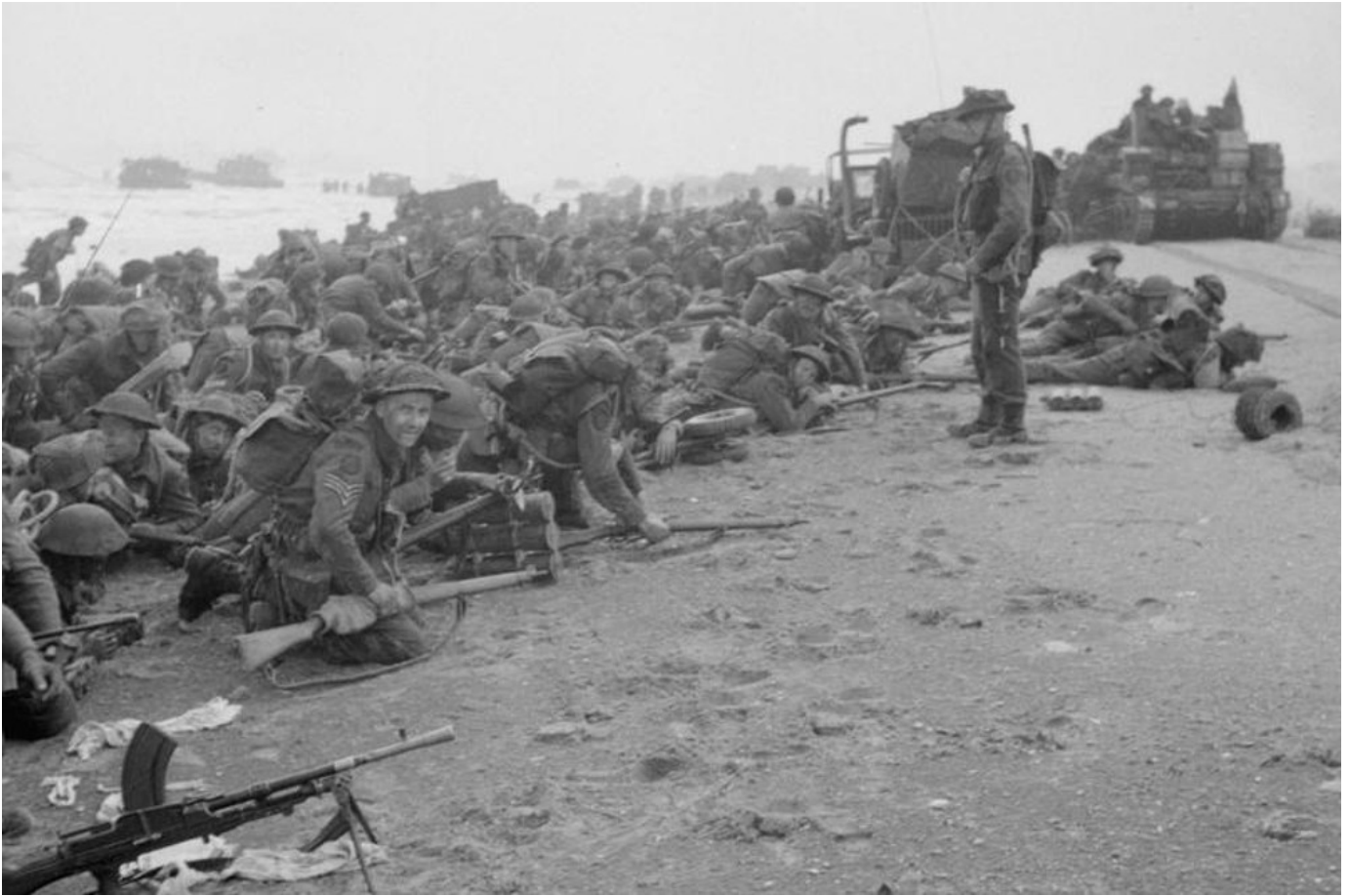
British commandos of 1st Special Service Brigade crouch on Queen beach, Sword area, before moving inland on June 6, 1944.