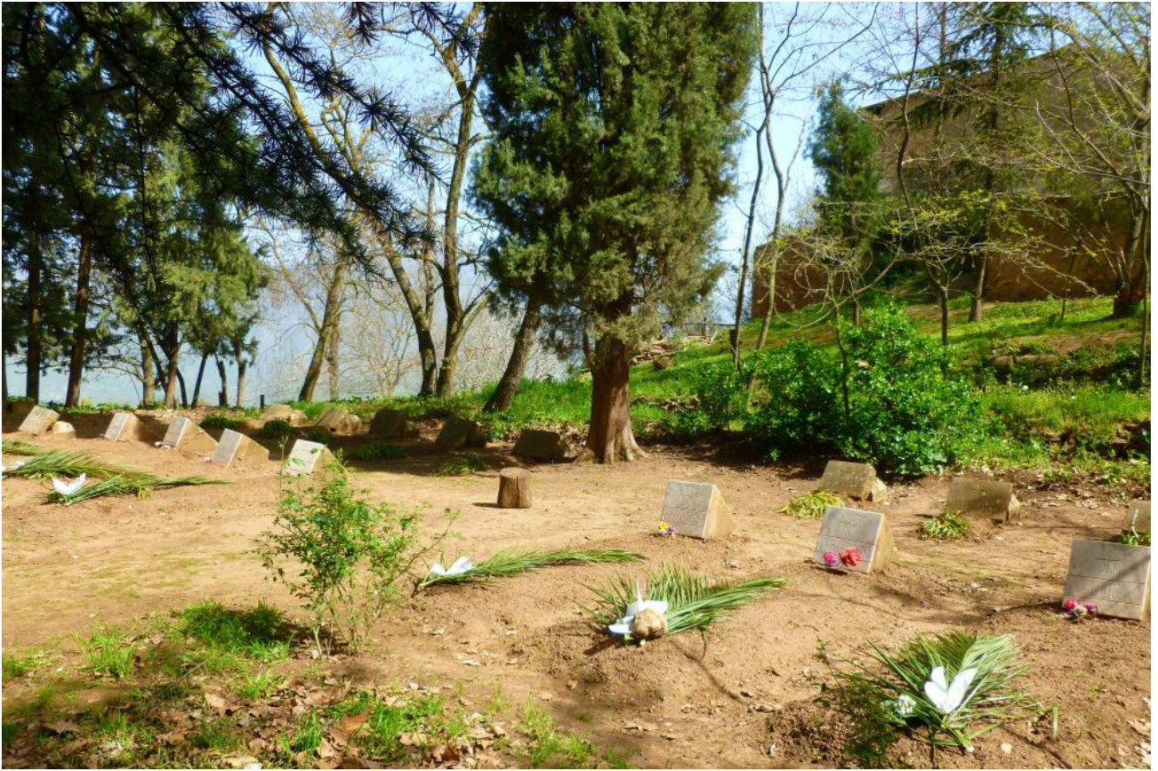
The graves of monks murdered in 1996 are seen in the cemetery of the Monastery of Notre Dame de l'Atlas near Medea, Algeria, in this undated photo.