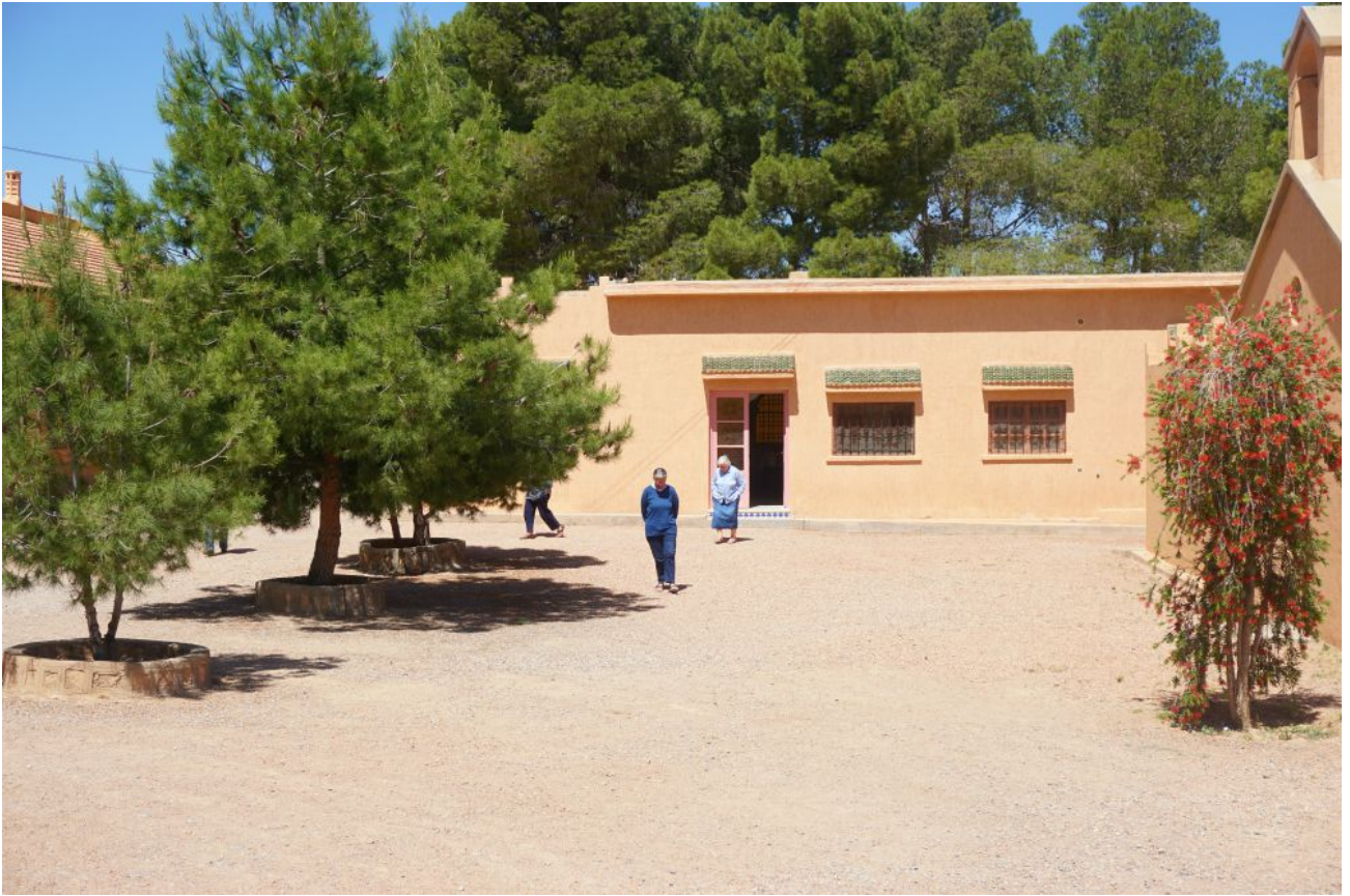
Courtyard of Notre Dame de l'Atlas monastery in Midelt, Morocco (W. M. Hughes)