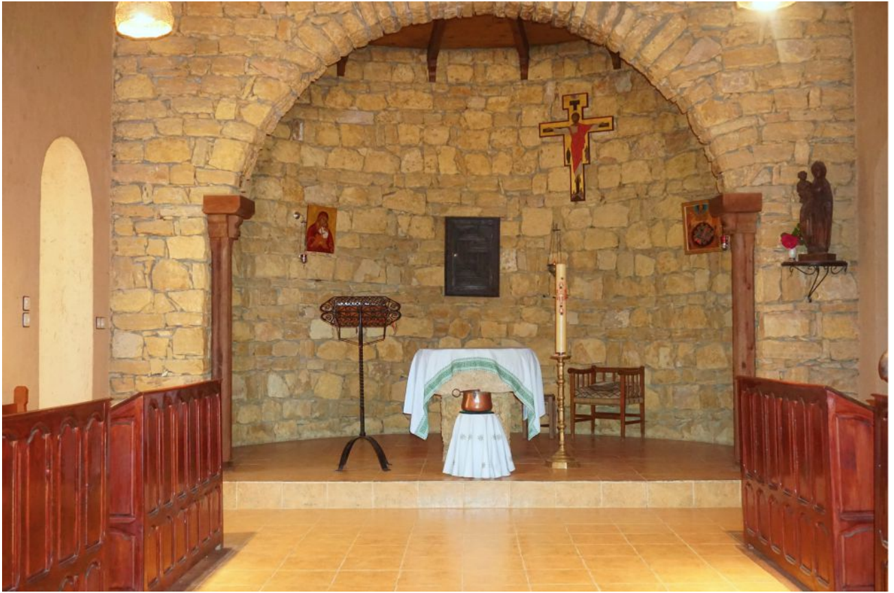
Chapel in the Notre Dame de l'Atlas monastery in Midelt, Morocco