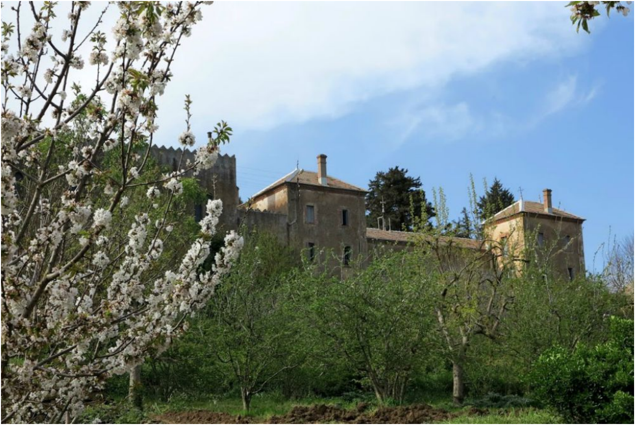
The Monastery of Notre Dame de l'Atlas near Medea, Algeria, is pictured in this undated photo.