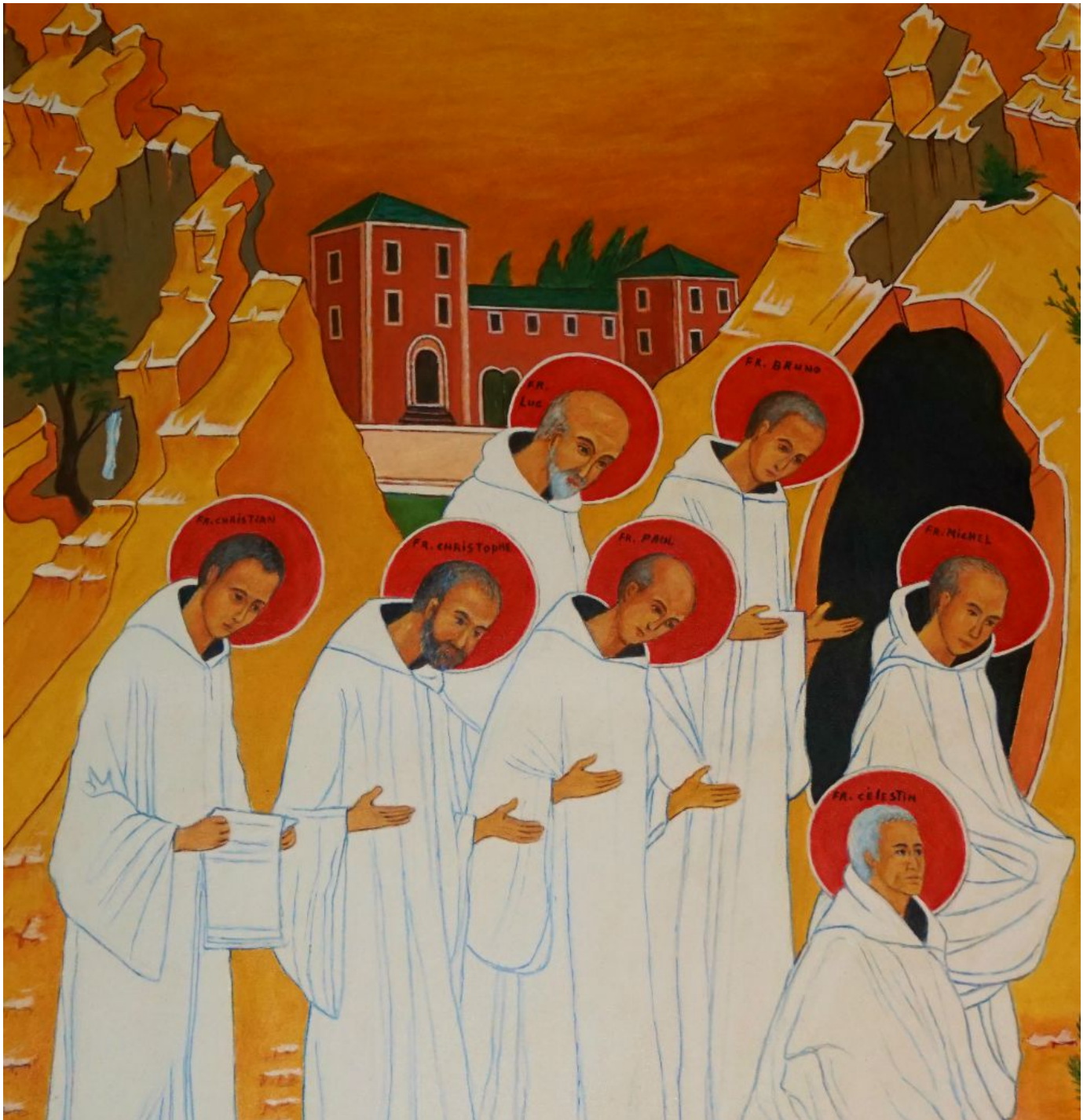
Detail of a painting hanging in the monastery chapel in Midelt, Morocco, showing the seven slain monks of Tibhirine at prayer.

Early in the morning of March 27, 1996, members of the Armed Islamic Group (GIA, for Groupe Islamique Armé) arrived at the abbey in Tibhirine and kidnapped the seven monks they found there. Missives between the GIA and the Algerian and French governments were exchanged as the GIA sought to trade the monks for a GIA