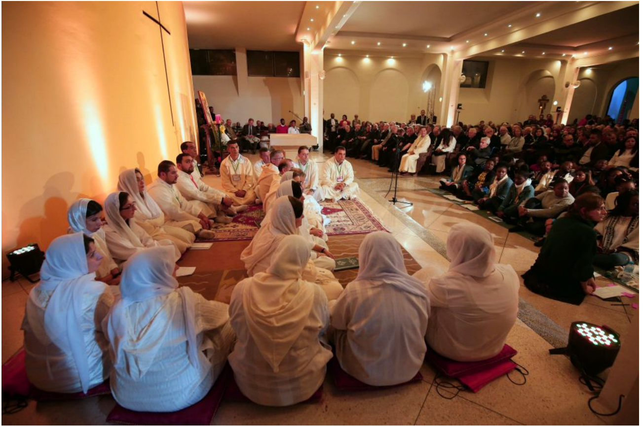
People attend a vigil at St. Mary's Cathedral in Oran, Algeria, Dec. 7, 2018. The vigil was to prepare for the beatification the following day of 19 religious men and women martyred in the course of the Algerian civil war.