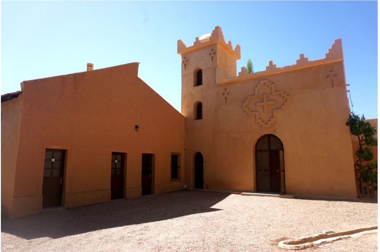
Notre Dame de l'Atlas monastery in Midelt, Morocco (W. M. Hughes) SLIDESHOW: CLICK THE ARROWS TO SEE MORE