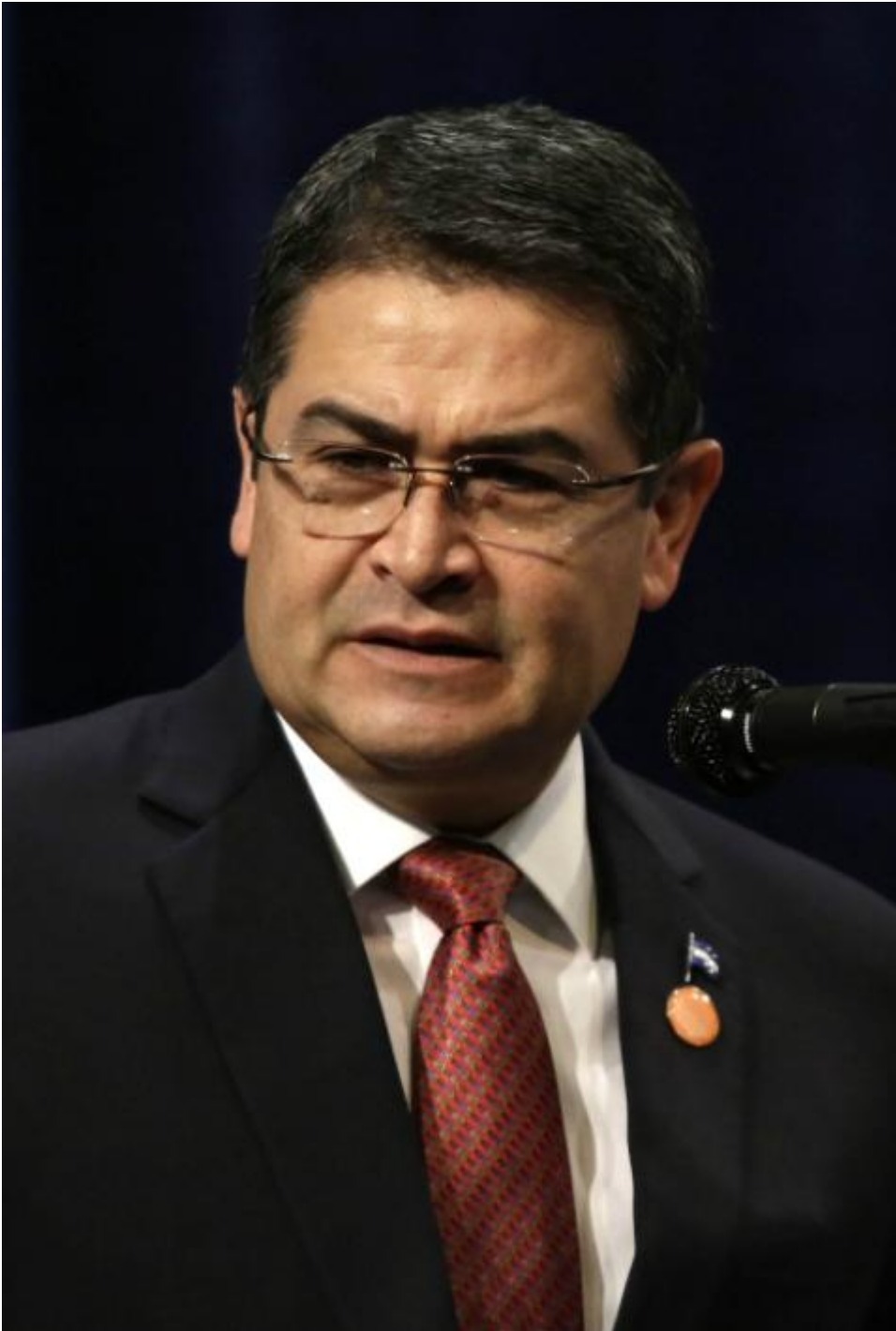
Honduras President Juan Orlando Hernández