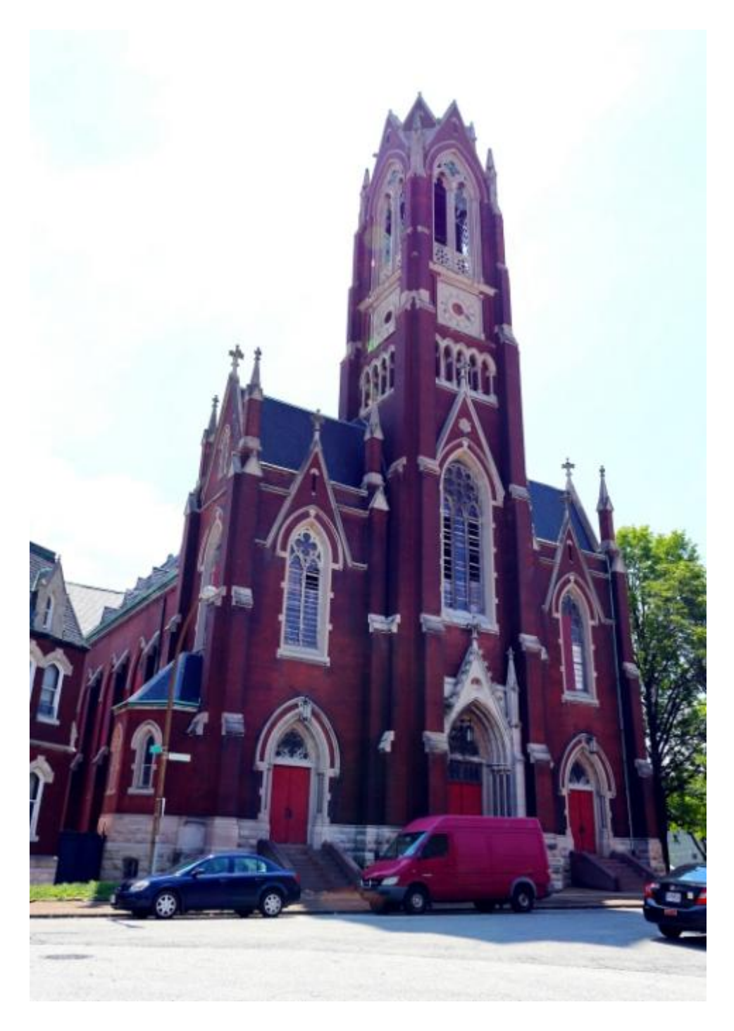
The former St. Liborius Catholic Church in Old North St. Louis

SK8 Liborius is perhaps not what architect William Schickel, who also designed the landmark Church of St. Ignatius Loyola in Manhattan, had in mind in the mid-1850s when he designed the stately red brick Gothic Revival structure.