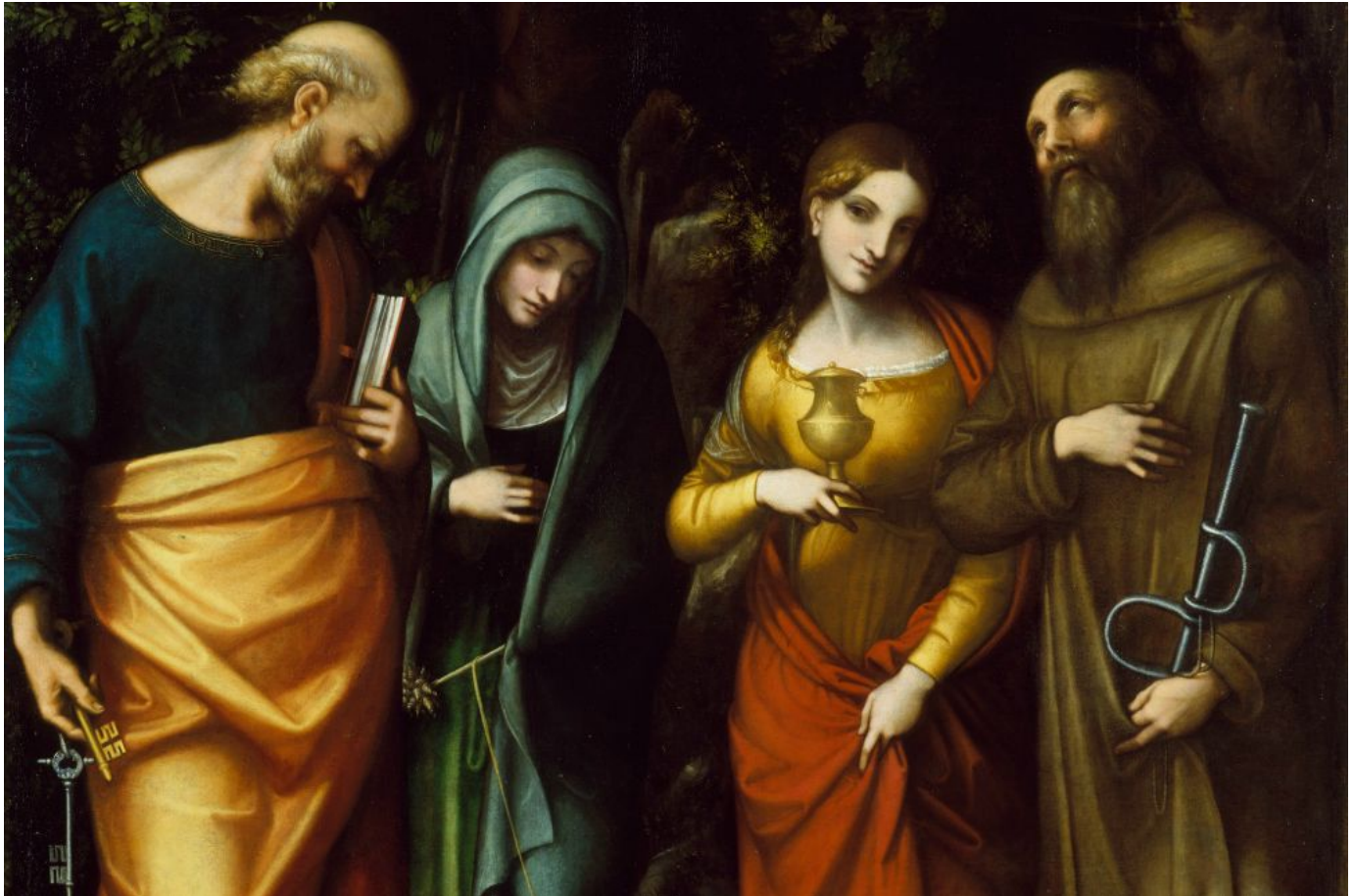
"Sts. Peter, Martha, Mary Magdalen and Leonard," painting by Correggio (Antonio Allegri), circa 1515 (Metropolitan Museum of Art)