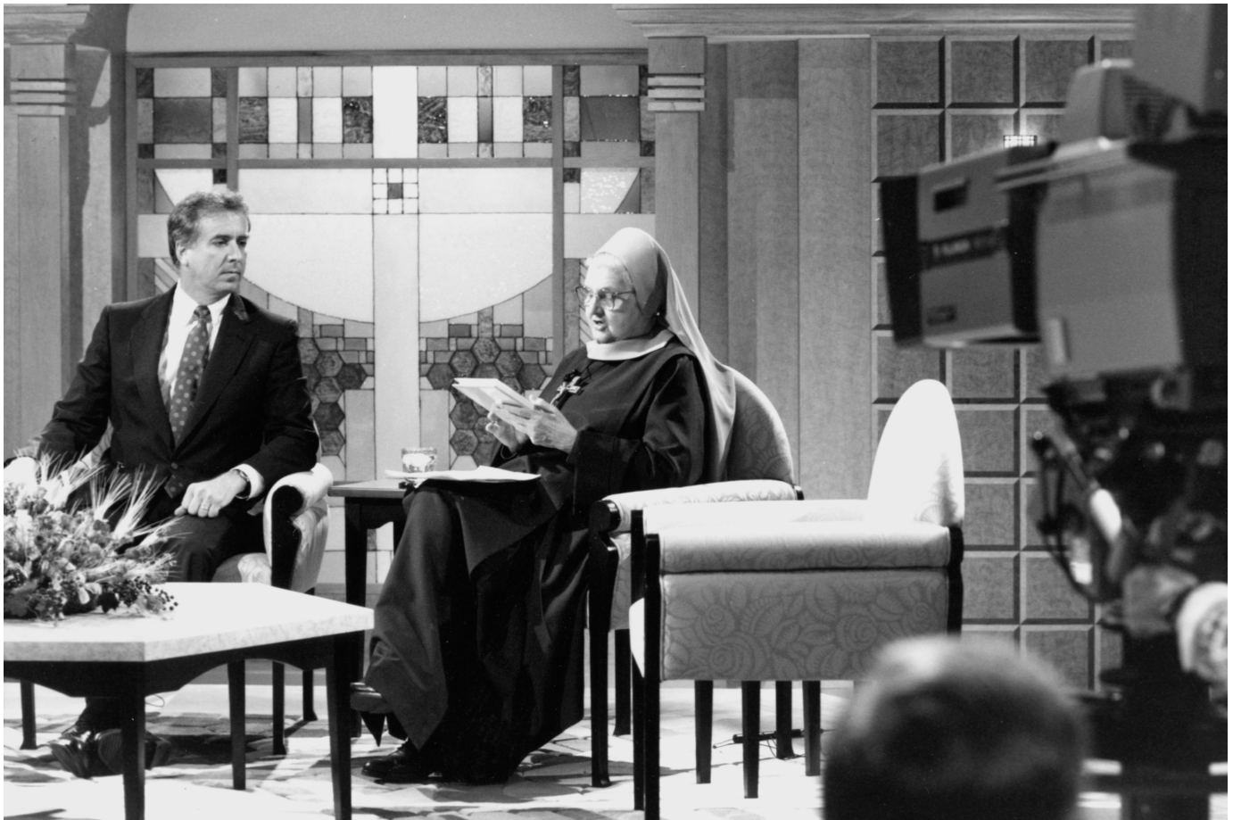
Mother Angelica, founder of the Eternal Word Television Network, on set in a 1992 photo.

Specifically mentioning inclusive language, centering prayer and earth spirituality, she added: "We're just tired of you constantly pushing anti-God, anti-Catholic and pagan ways into the Catholic Church. Leave us alone. Don't pour your poison, your venom, on all the church."