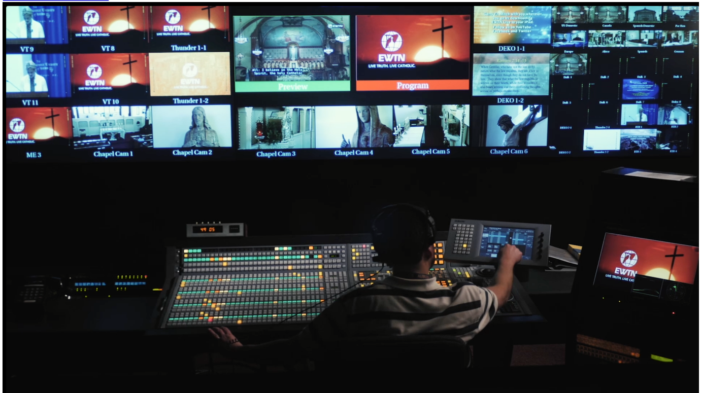
The control room at the EWTN studios in Irondale, Alabama.