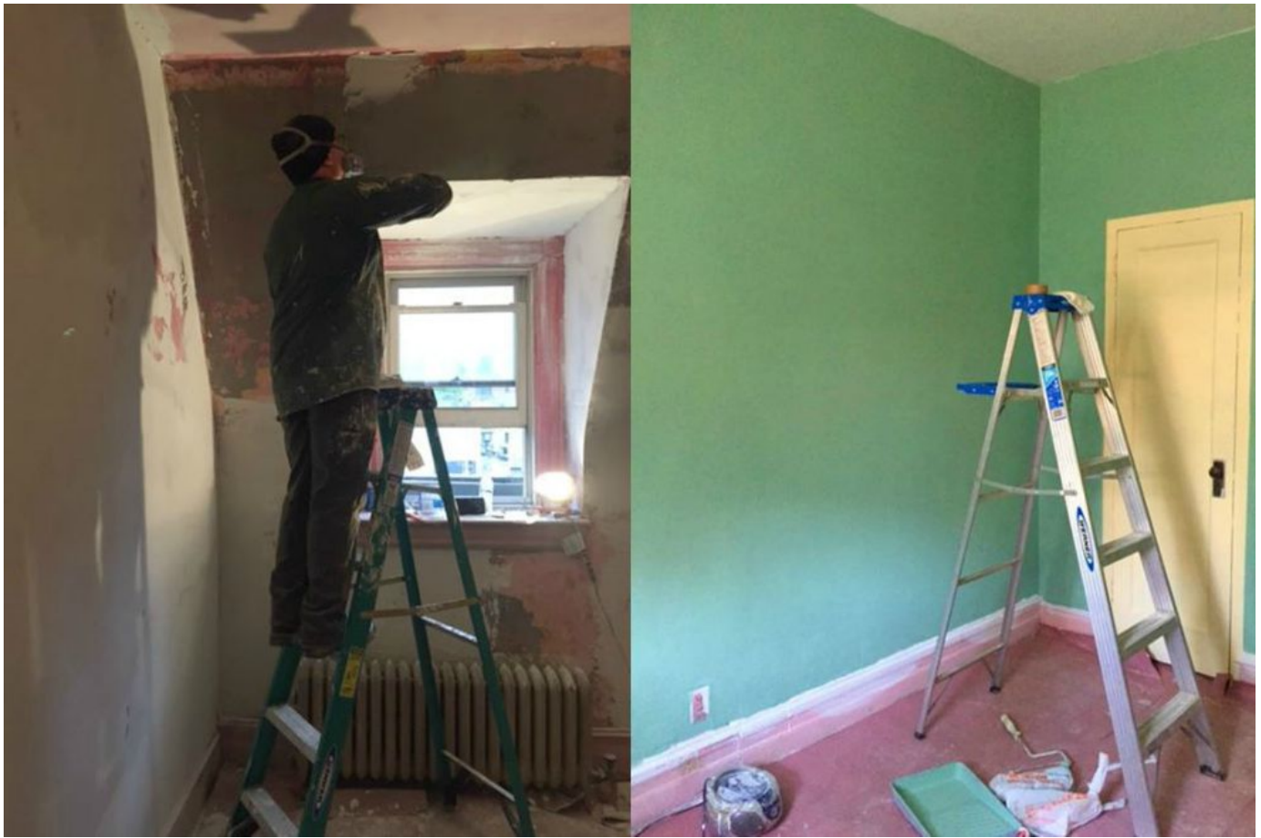
Left: Many of the small bedrooms at the former convent were in significant disrepair; right: A bedroom pictured after restoration