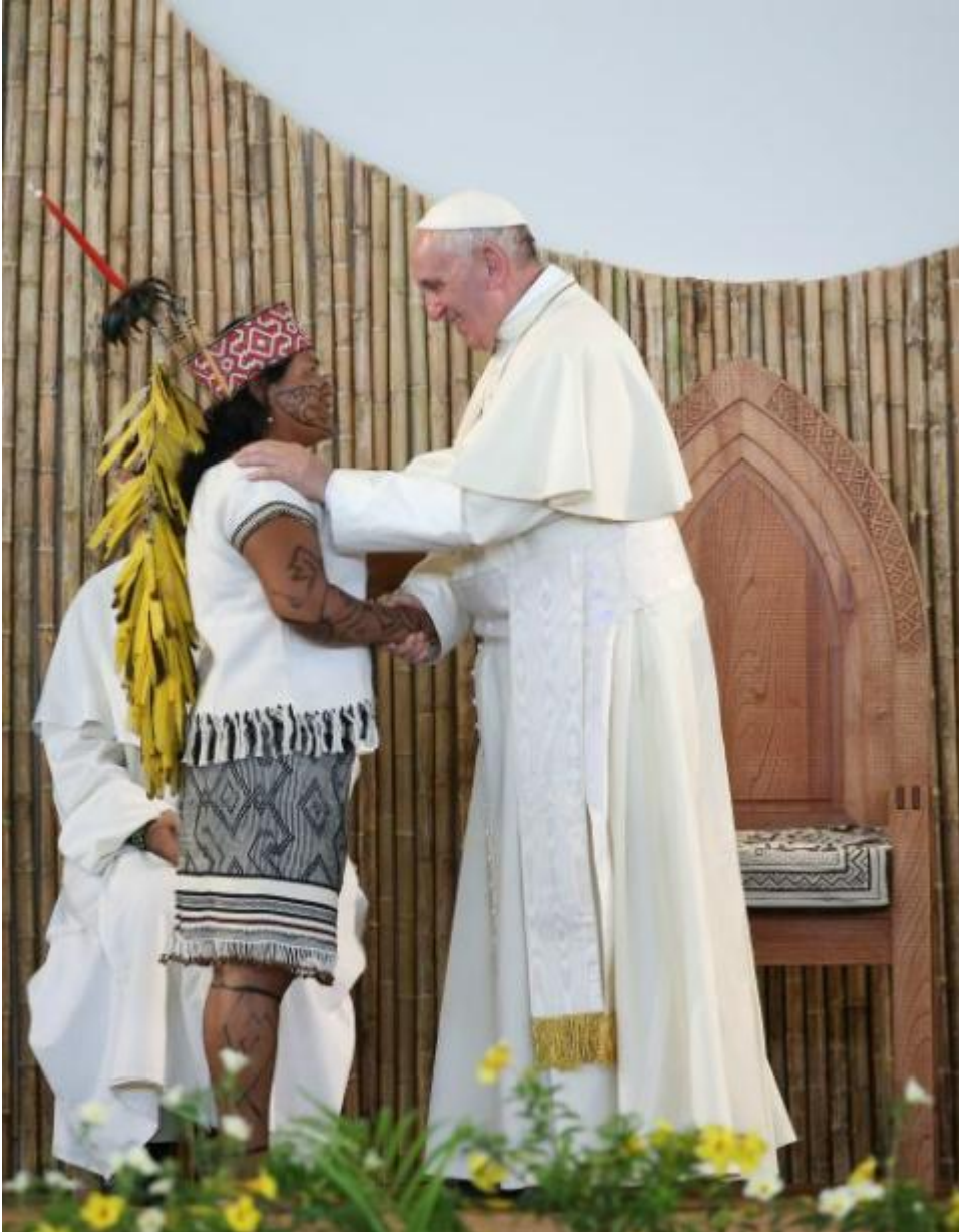
Pope Francis is greeted by a member of an indigenous group from the Amazon region during a meeting at the Coliseo Regional Madre de Dios in Puerto Maldonado, Peru, Jan. 19, 2018.

this synod would draw global attention to a region that has seen indigenous peoples robbed of both their land and their right to self-determination. These peoples have often been victims of drug and human trafficking. Moreover, there are more than 100 indigenous communities in that region that are "voluntarily isolated" from the larger world; their fragile existence is now under threat. Francis is committed to a polyhedral vision of both church and society, where genuine cultural differences do not threaten but rather enrich an authentic global consciousness.