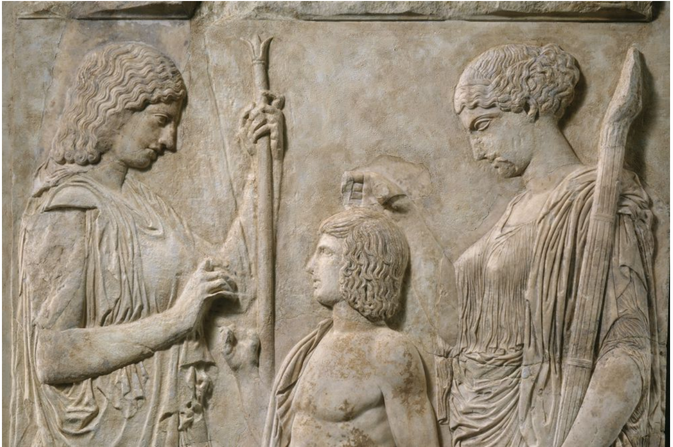
Detail of a marble fragment of the Great Eleusinian Relief, Roman circa 27 B.C. to 14 A.D. depicting Demeter, left, and Persephone, right, with a boy thought to be Triptolemos, who was sent by the goddess to teach people how to cultivate grain, in center (Metropolitan Museum of Art)