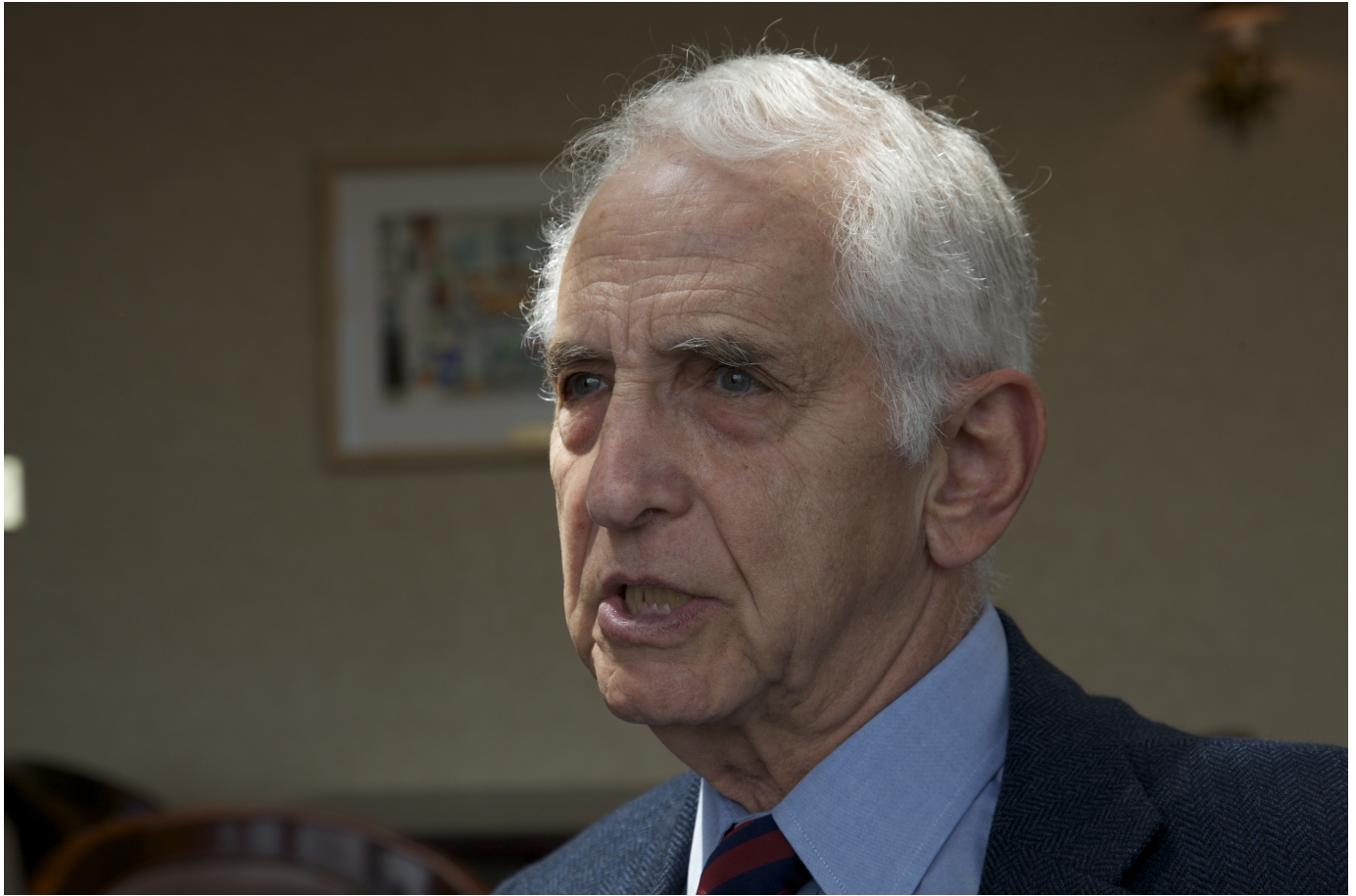
Daniel Ellsberg, in a 2008 photo