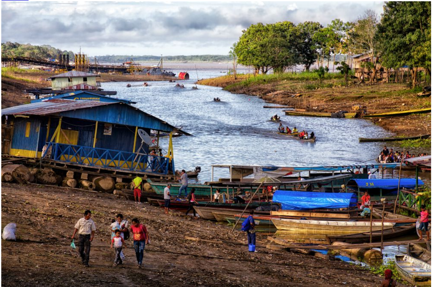
Harbor in Leticia, Colombia, July 2012