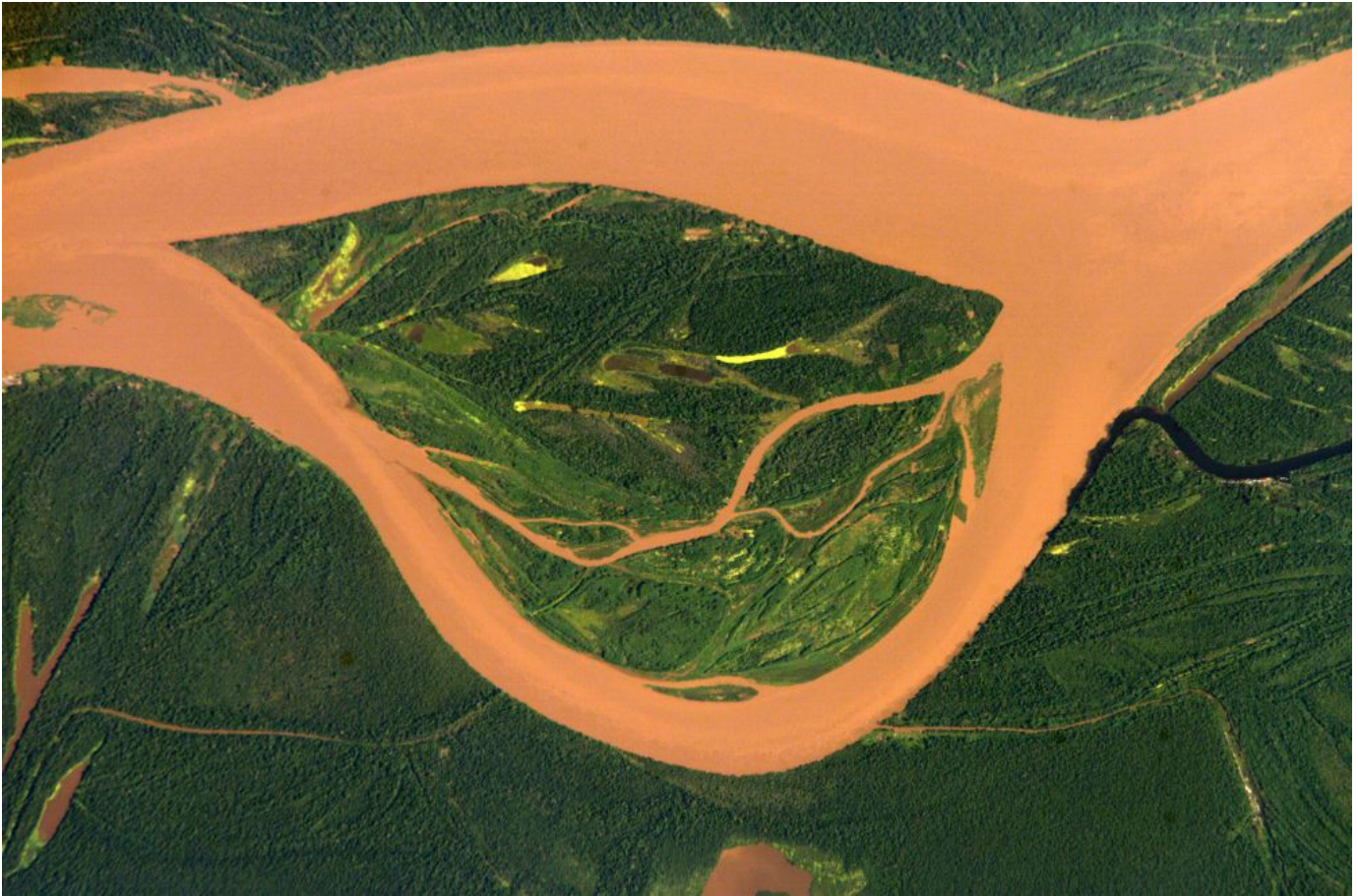
Amazon River 59 miles upstream from Tabatinga, Brazil/Leticia, Colombia, June 2002