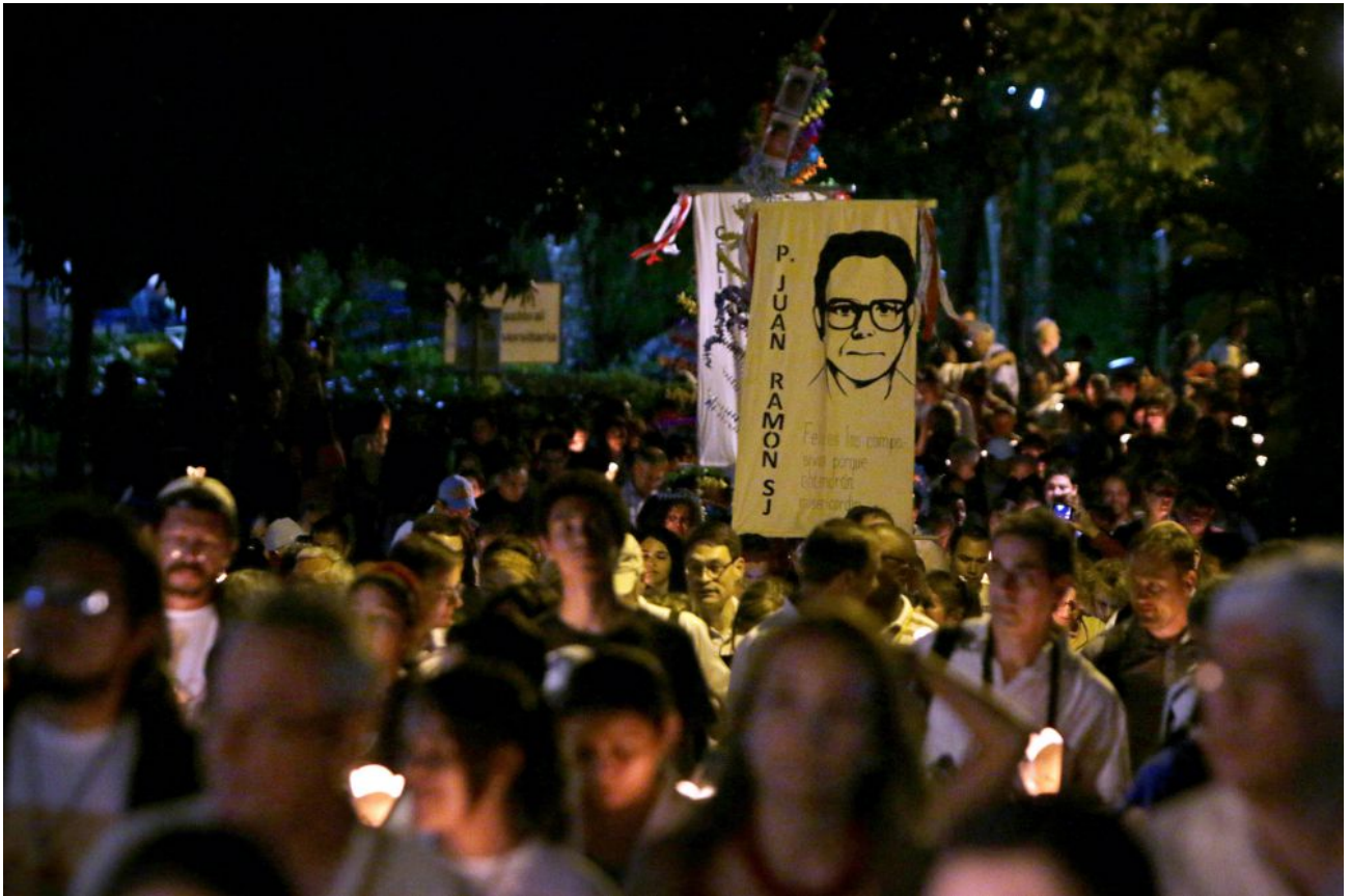
Salvadorans take part in a procession Nov. 15, 2014, at Central American University in San Salvador, El Salvador, to commemorate the killing of six Jesuit priests and two women by the Salvadoran military 25 years ago.