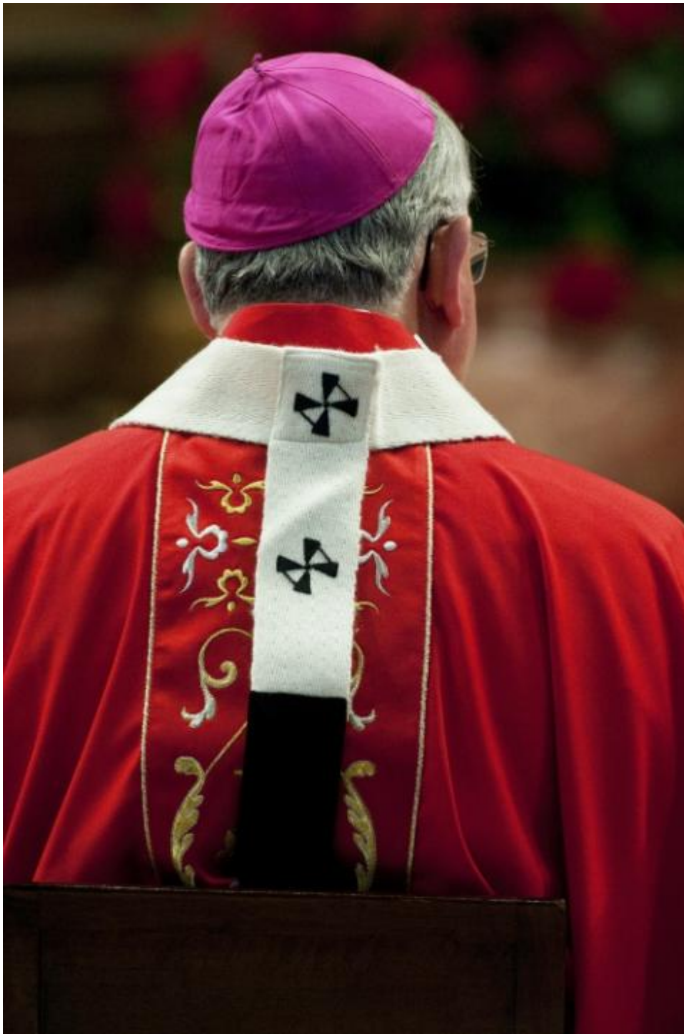
Archbishop José Gomez wears his woolen pallium during Mass in St. Peter's Basilica at the Vatican June 29, 2011. Pope Benedict XVI presented the pallium — a symbol of an archbishop's communion with the Holy Father — to 41 archbishops during the service.