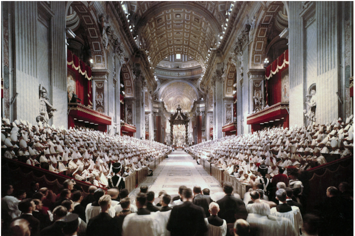
Pope John XXIII leads the opening session of the Second Vatican Council in St. Peter's Basilica at the Vatican Oct. 11, 1962.

This book is recommended to anyone who struggles to understand the meaning of the Second Vatican Council and who is not enlightened by the polarized antagonisms of recent decades. It is a long book, admirably clear in the way it approaches sometimes complex issues, and rewards the reader from its first word to its last.