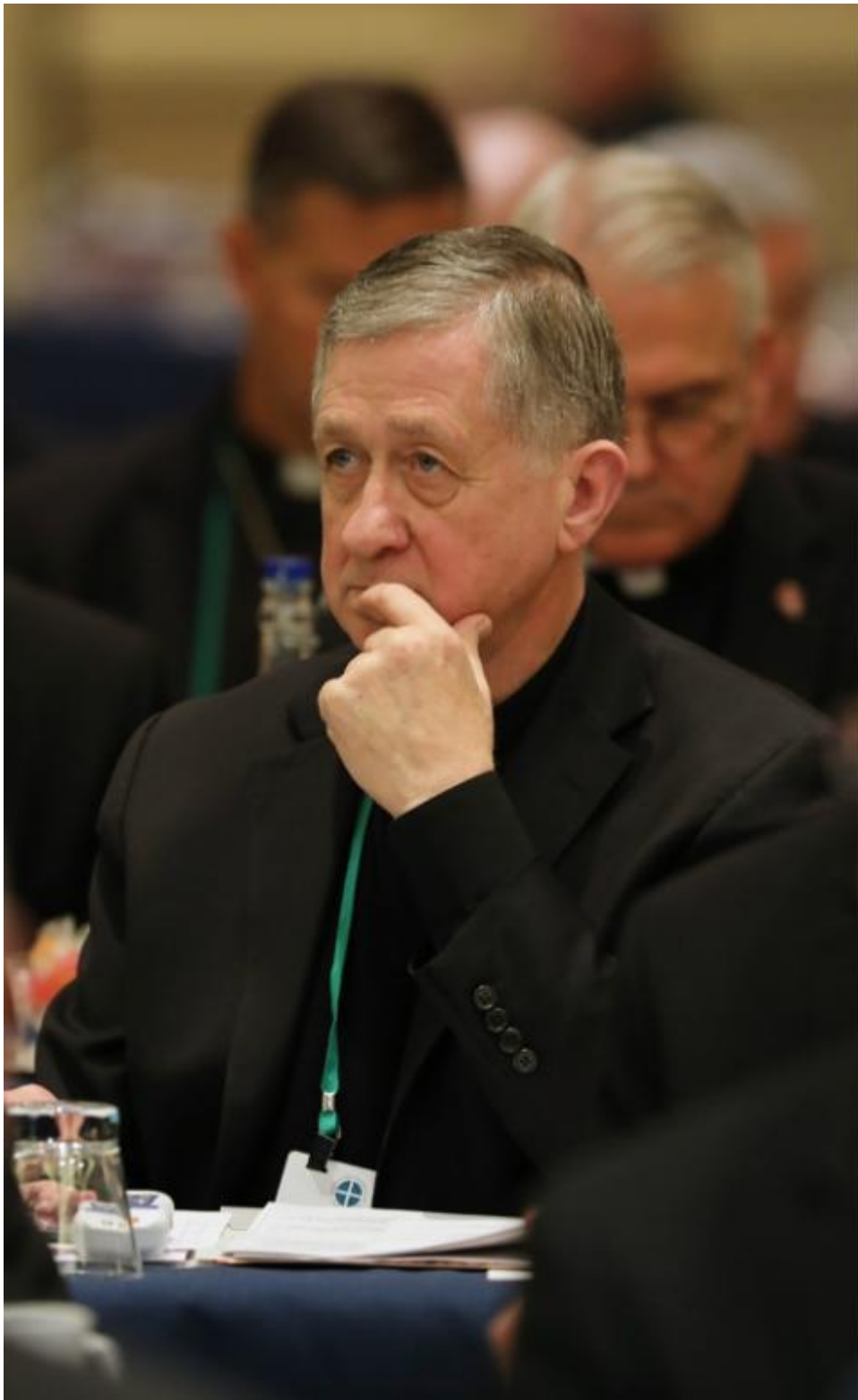
Chicago Cardinal Blase Cupich listens to a speaker during the U.S. bishops' fall general assembly in Baltimore Nov. 11.