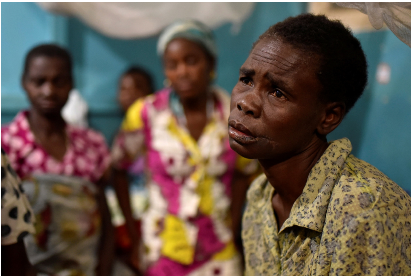
A victim of ethnic violence rests inside a hospital on June 25 in Bunia, Congo.

"We do have the opportunity to do [go to detention centers]. But the centers are at very high capacity. And there are a lot of people with so many needs. Even asylum claimers are in detention, which shouldn't be like that, but that's the policy," she said.