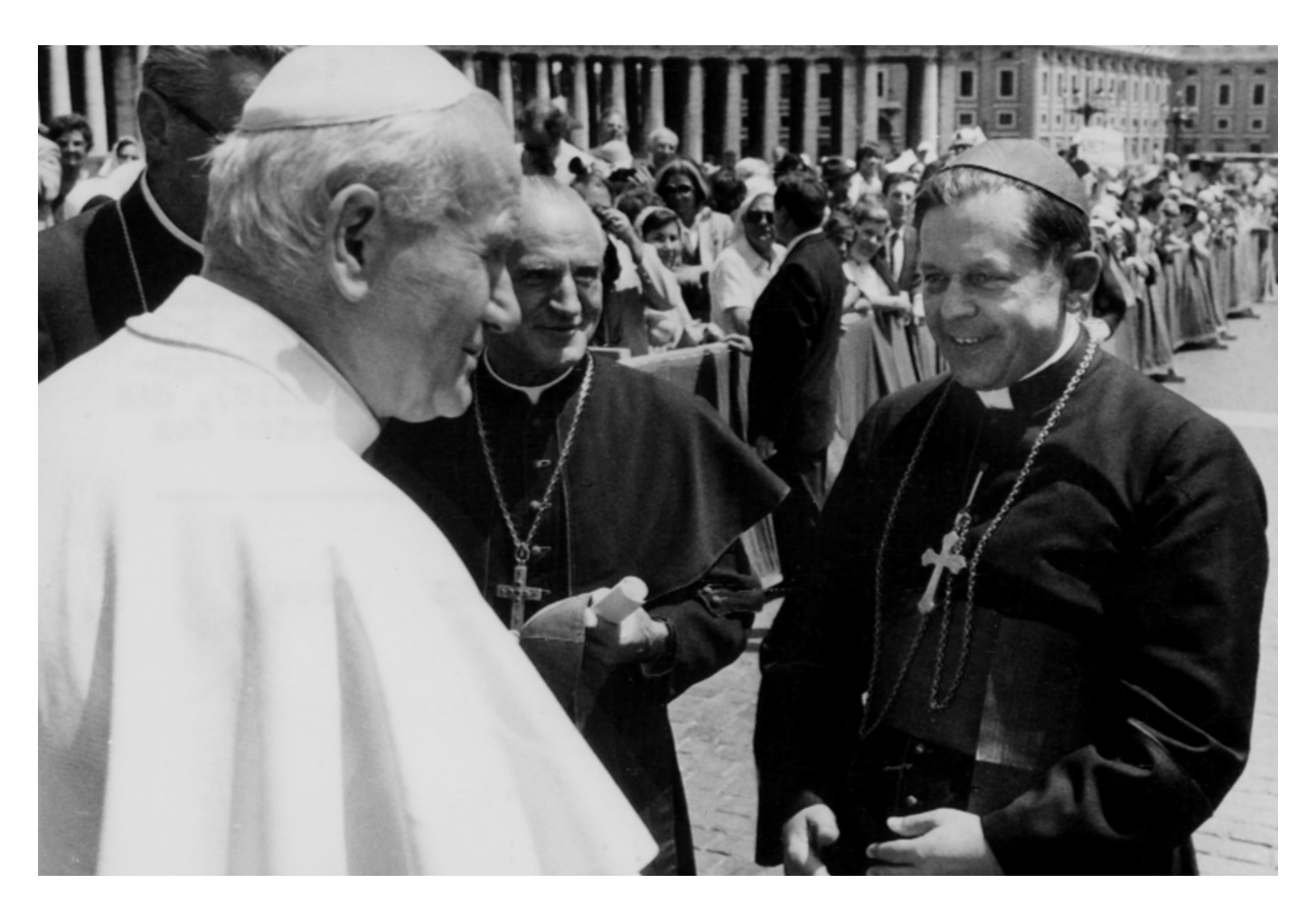
Pope John Paul II is pictured in a 1983 photo greeting Polish Cardinal Jozef Glemp of Warsaw.

The church has had to contend with its own problems. Hopes of a mass religious revival, high in the first years after communist rule, faded as consumer lifestyles diluted popular enthusiasm.