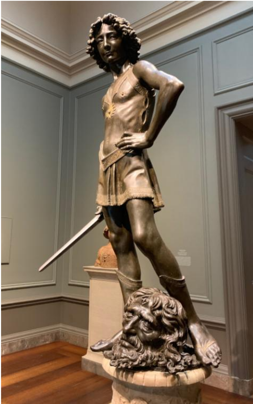
"David with the Head of Goliath," circa 1465, by Andrea del Verrocchio, in bronze with partial gilding at the Museo Nazionale del Bargello in Florence, Italy