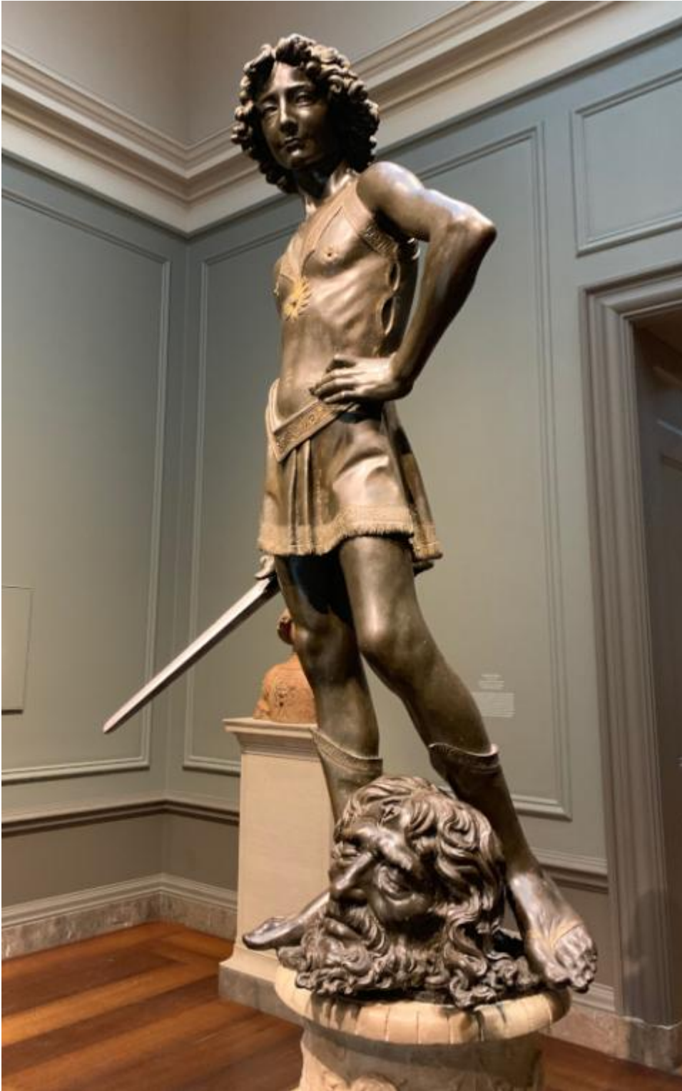
"David with the Head of Goliath," circa 1465, by Andrea del Verrocchio, in bronze with partial gilding at the Museo Nazionale del Bargello in Florence, Italy