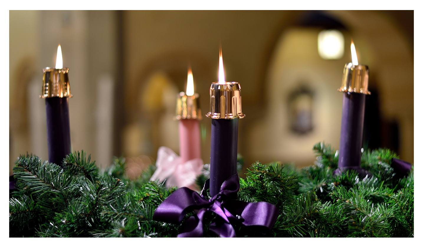
An Advent wreath.

"We are in the beginning of a mass extinction and all you can talk about is money and fairy tales of eternal economic growth. How dare you?"