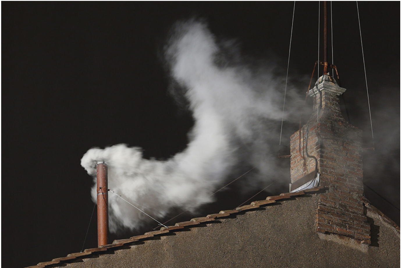
White smoke billows from the chimney of the Sistine Chapel March 13, 2013, at the Vatican.