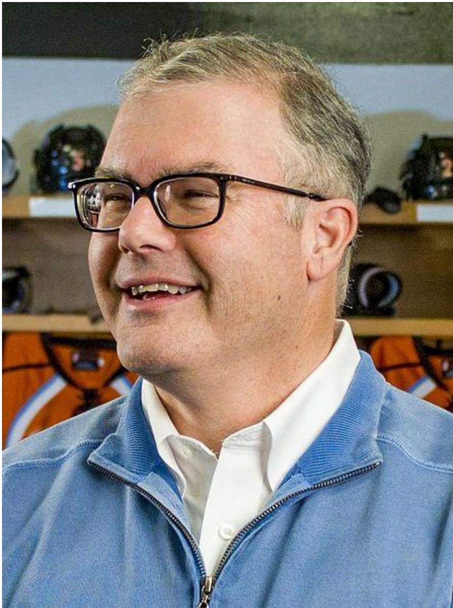
Lamar Hunt Jr.

That would currently leave only Caster and Lamar Hunt Jr. to make those decisions.