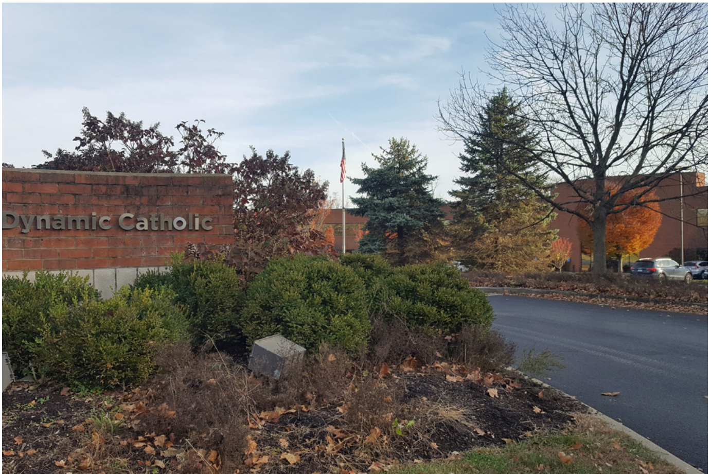
Exterior of the Dynamic Catholic Institute building in Erlanger, Kentucky