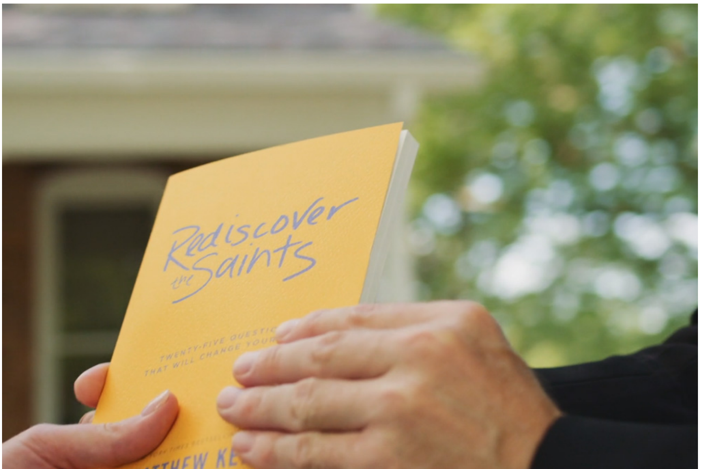
Screenshot from the Parish Book Program promotional video on the Dynamic Catholic website

But the Parish Book Program also seems to be something of a middle man between Dynamic Catholic donors and Kelly's for-profit publishing businesses, especially Beacon Publishing.