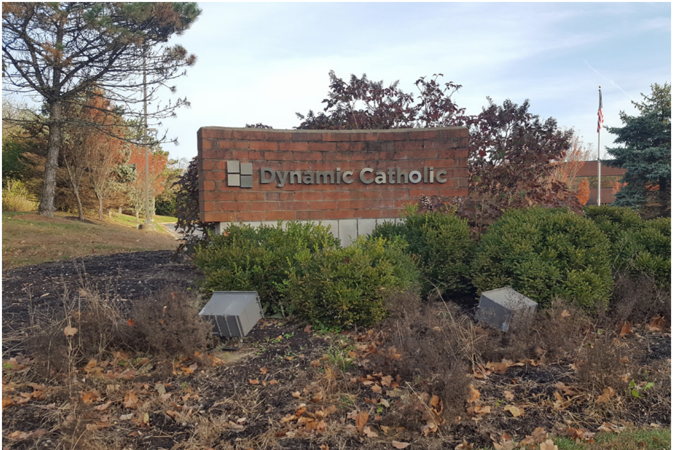
Sign for the Dynamic Catholic Institute in Erlanger, Kentucky