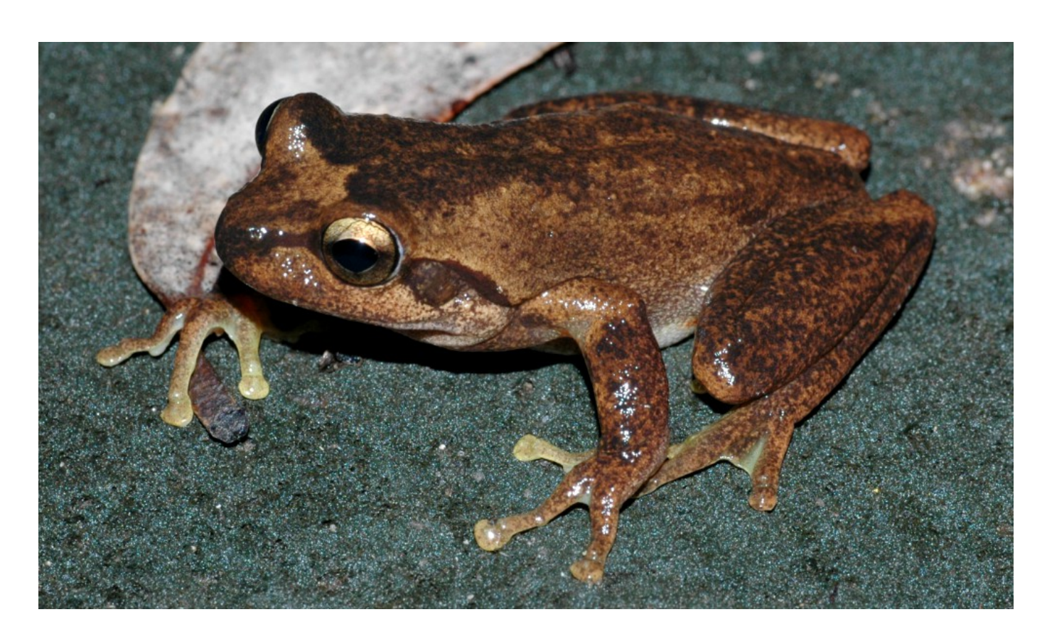
A Littlejohn's tree frog, one of the species severely affected by bushfires in Australia

It is not enough, however, to think of different species merely as potential "resources" to be exploited, while overlooking the fact that they have value in themselves. Each year sees the disappearance of thousands of plant and animal species which we will never know, which our children will never see, because they have been lost for ever. The great majority become extinct for reasons related to human activity. Because of us, thousands of species will no longer give glory to God by their very existence, nor convey their message to us. We have no such right.