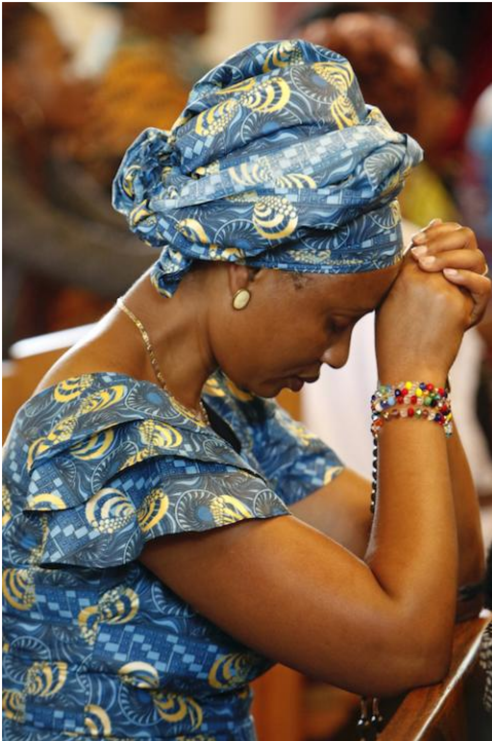
A woman prays prior to a Mass for Catholics of Nigerian descent July 21, 2019, at St. Thomas the Apostle Chapel in West Hempstead, New York.