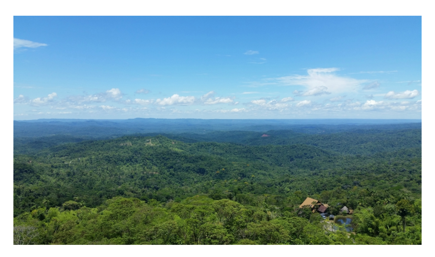
A view of the Amazon rainforest on the Puyo-Macas road in Ecuador

This is when it comes to mind what's been the center of our REPAM approach in this whole process: It's the lives of the peoples and the promise to respect and honor their voices that have brought us here. It is our commitment to come back here and to be able to look them in their eyes to tell them we've fulfilled our promise to bring their voices to the pope so they would be heard, and to make sure their most urgent cries and hopes would be respected and acknowledged.