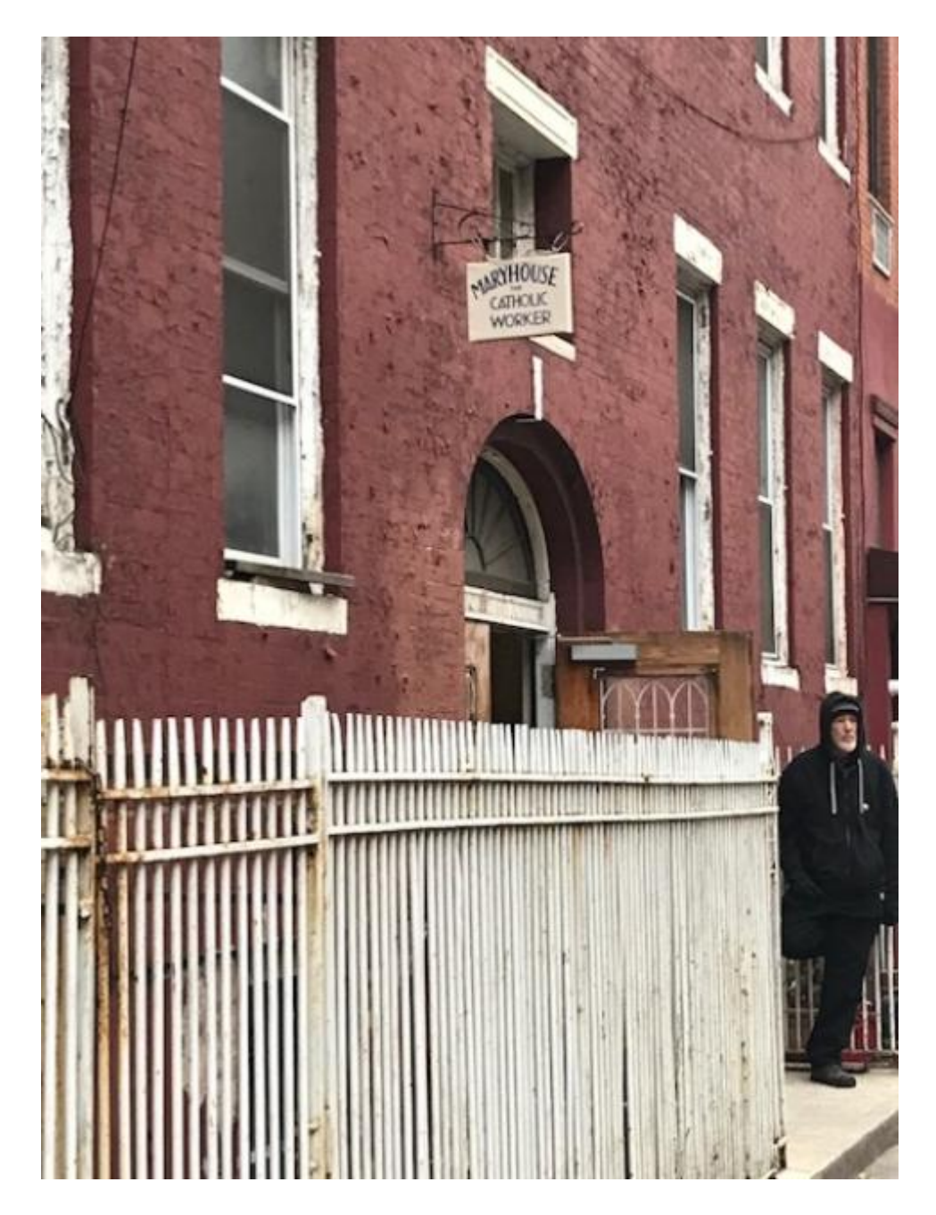
The Catholic Worker Maryhouse shelter and soup kitchen in New York City

That legacy is being tested in Day's canonization cause led by the New York Archdiocese, an entity that clashed with Day's militant pacifism in the midst of the Cold War. Day once famously remarked that she didn't want to be considered a saint, because she didn't want to be dismissed that easily.