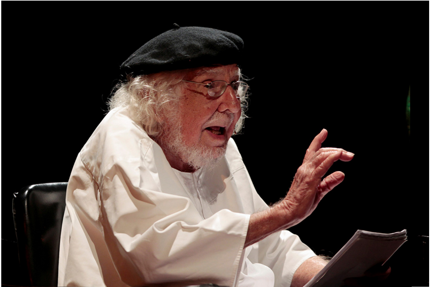
Nicaraguan poet, priest and Reina Sofia Prize winner, Fr. Ernesto Cardenal, speaks during a celebration for his 90th birthday at the National Theatre Ruben Dario in Managua, Nicaragua, Jan. 27, 2015.

He could display patience at times. I heard him read his poetry in Berkeley in the 1970s, when he was on one of his tours drumming up solidarity for the insurrection. In a conversation afterward with the audience, he spoke only Spanish, though he was perfectly fluent in English. At one point, his translator was having a hard time with a particular phrase. Cardenal repeated himself, in Spanish. The translator kept on bumbling it, until finally the priest leaned over and whispered the correct English translation in his ear.