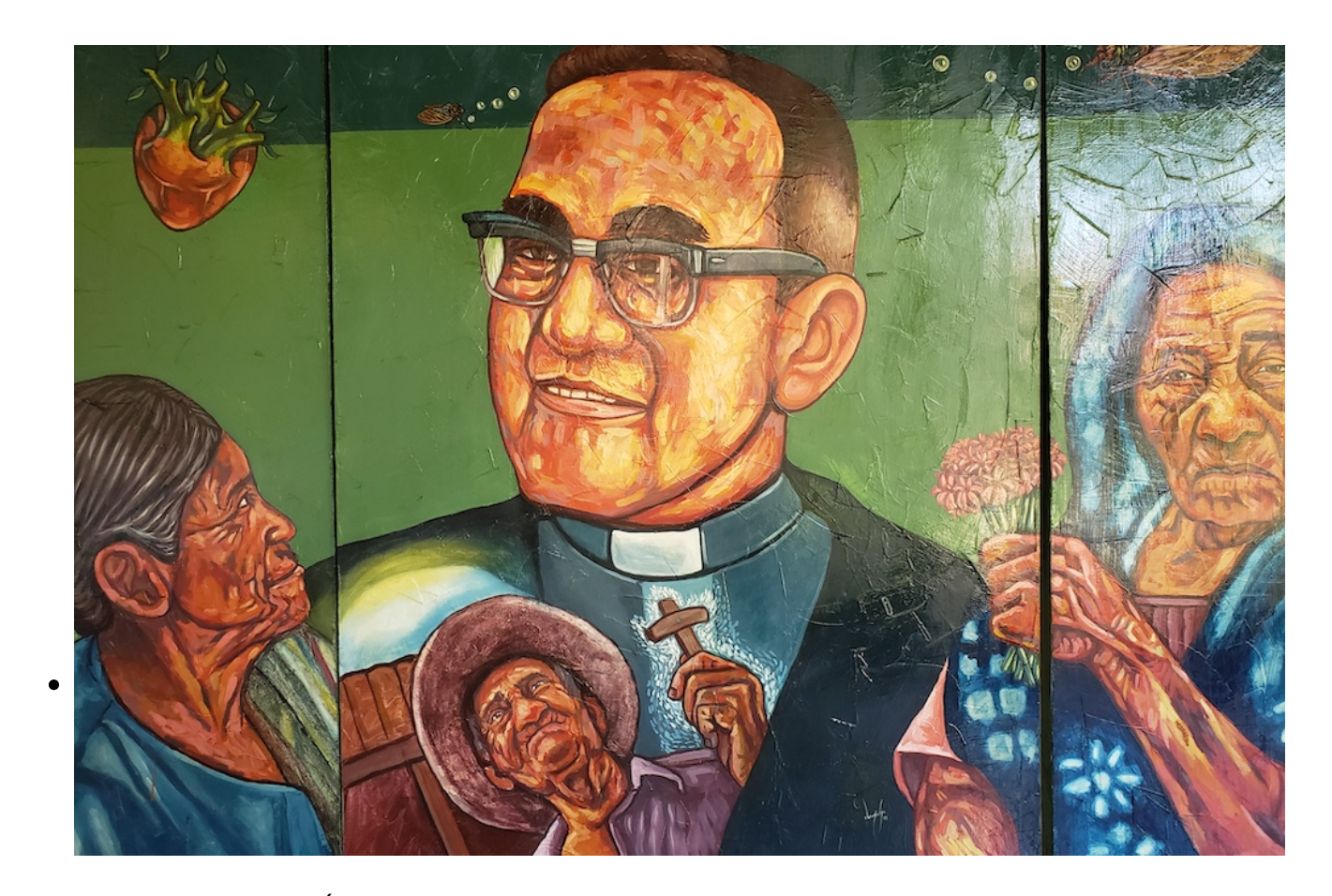
This painting of Óscar Romero is at a museum dedicated to peace in the town of Suchitoto, El Salvador.