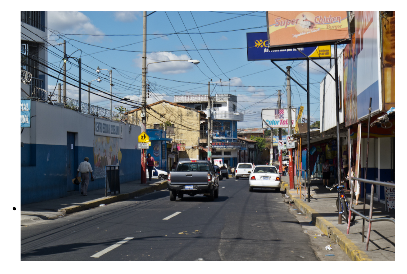
Street scene in Mexicanos, El Salvador,pictured in May 2015