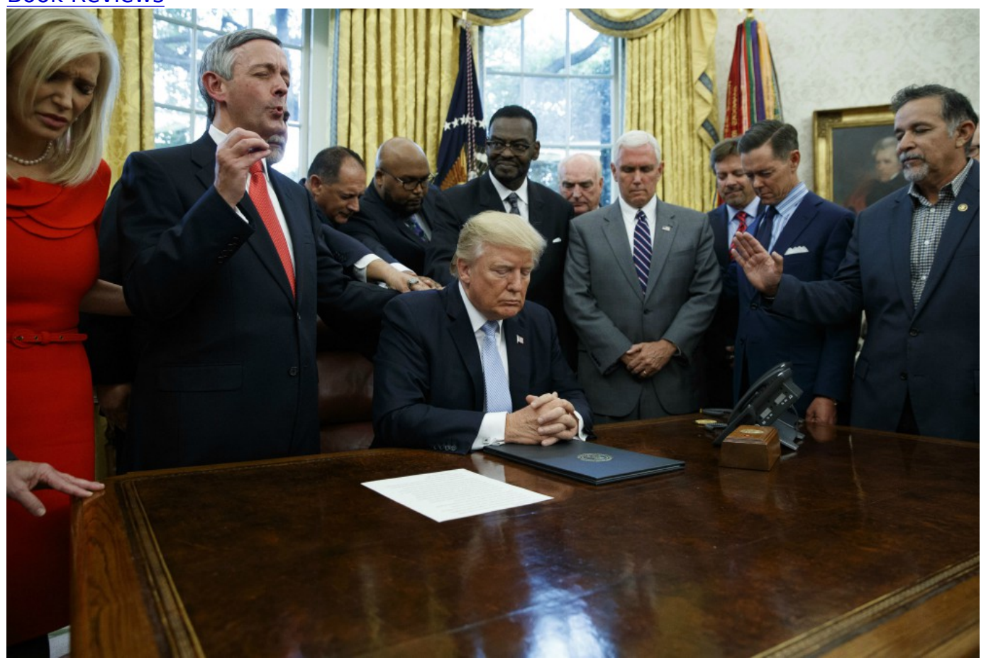
On Sept. 1, 2017, religious leaders pray with President Donald Trump in the Oval Office of the White House in Washington after he signed a proclamation for a National Day of Prayer to occur on Sunday, Sept. 3, 2017.