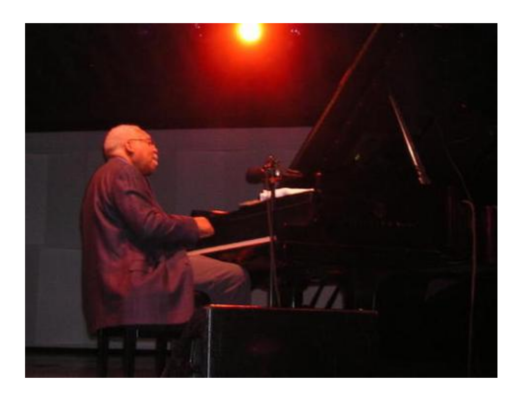
Ellis Marsalis Jr. performing at Hartwood Acres, Pittsburg, Pennsylvania, June 6, 2004

The Times-Picayune | The New Orleans Advocate gave substantial <u>coverage</u> to Marsalis' passing, and as national media tributes poured in, WWOZ, the community radio station played long segments of his music.