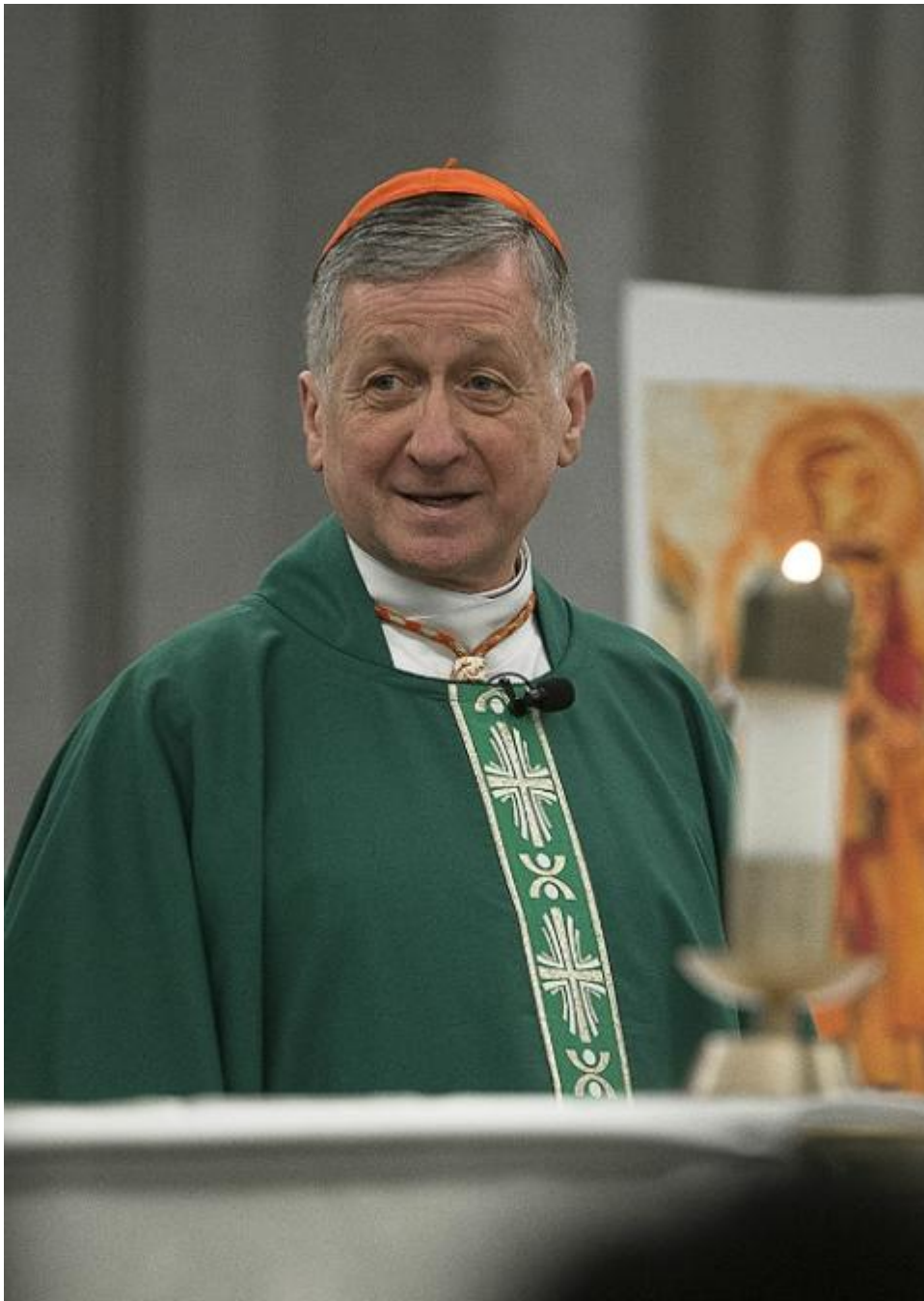
Cardinal Blase Cupich at the Catholic Social Ministry Gathering in Washington in January

"We are going to continue with our Renew My Church program, but what we're going to do with anything in regard to the merging or closing of parishes is follow our discipline," he said. "Our main thing is: What's the long-term sustainability of a place, and the need of a place in a certain area."