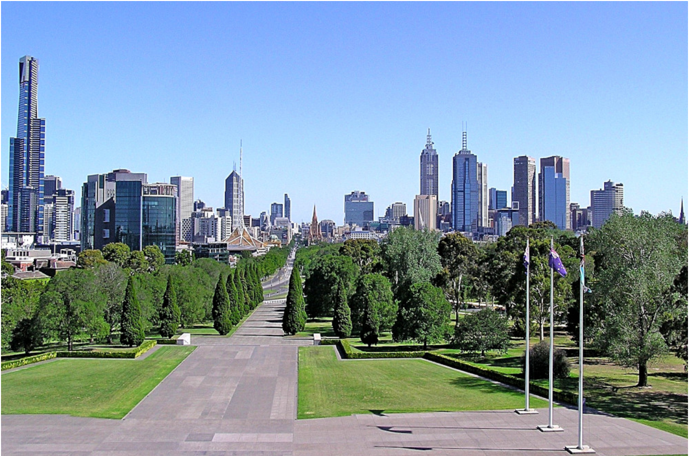
Shrine of Remembrance, Melbourne, Australia.